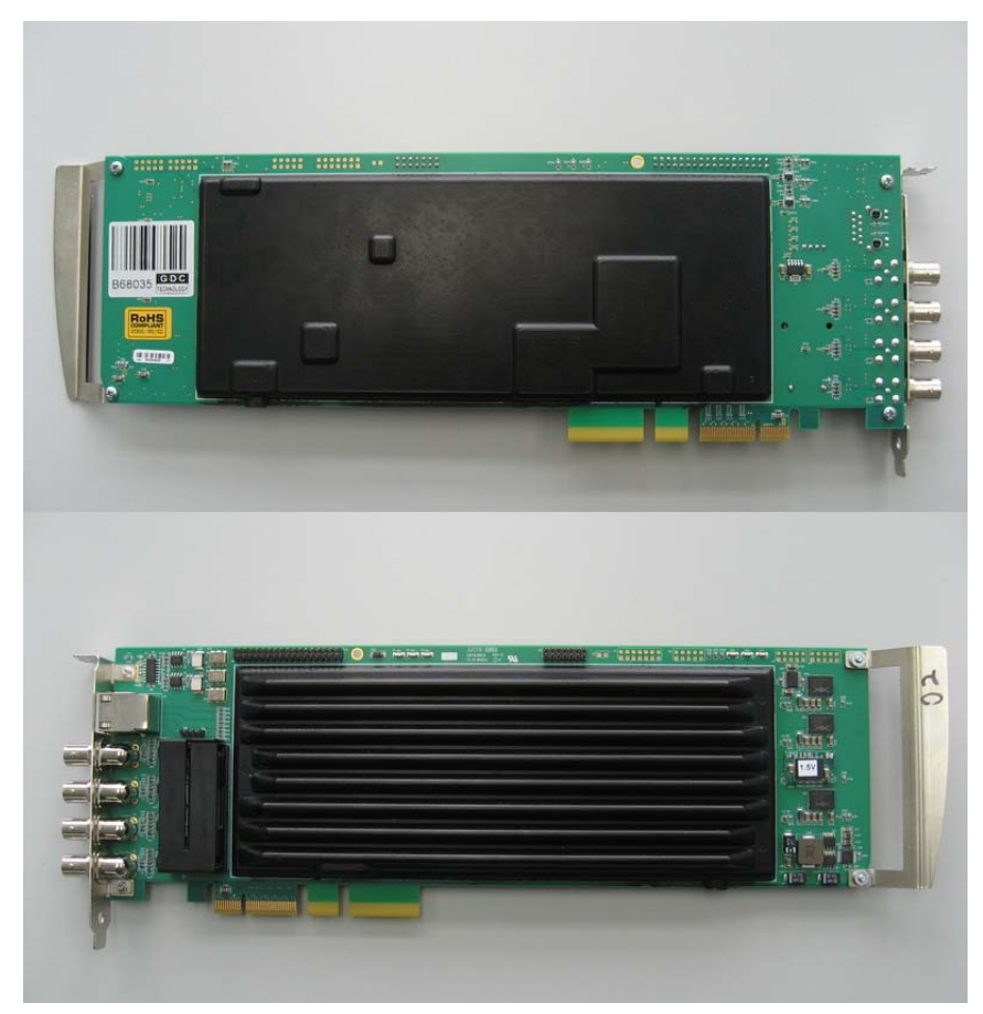
Figure 2 – Image of the Z-OEM-DCI-R2 (Top & Bottom)