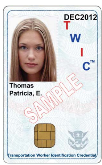
Figure 1: Sample ID-One PIV cards