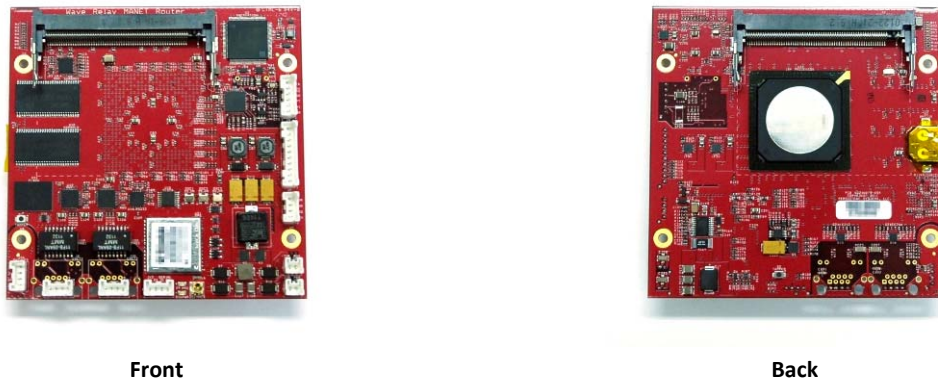
Figure 2 – Physical Boundary of Wave Relay Dual Radio Board