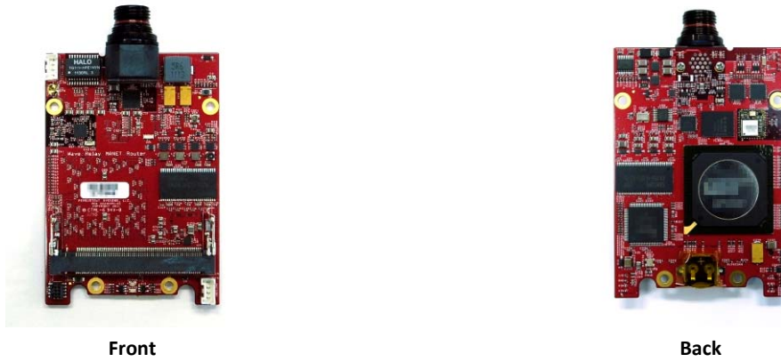
Figure 1 – Physical Boundary of Wave Relay Single Radio Board