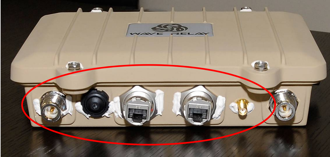
Figure 8 – Tamper-evident material placement for Quad Radio Router Bottom (9 locations indicated by the red circle)