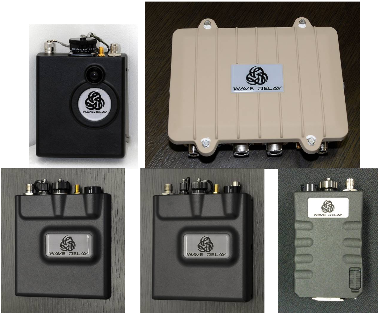
Figure 1 – Physical Boundary of MPU2 (top left), MPU3S (bottom left), MPU3D (bottom center), MPU4 (bottom right), and QRS (top right)

The tamper evident seals and tamper evident material shall be applied to the module to operate in a FIPS Approved mode of operation.