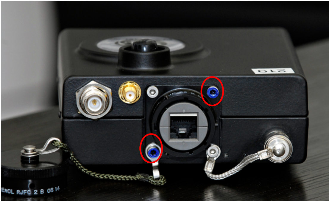
Figure 2 – Tamper-evident material placement for MPU Top (2 locations indicated by red circles)