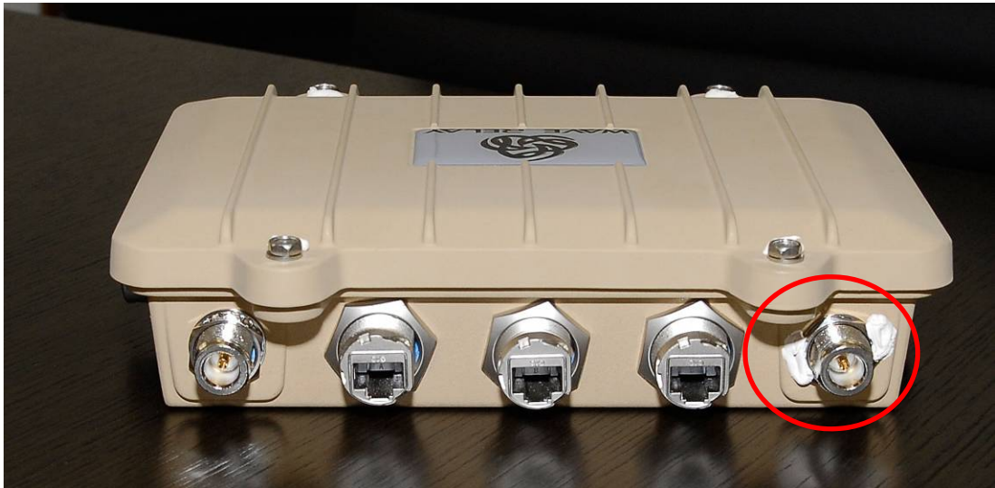
Figure 7 – Tamper-evident material placement for Quad Radio Router Wireless Radio Port (Top – 2 locations indicated by the red circle)