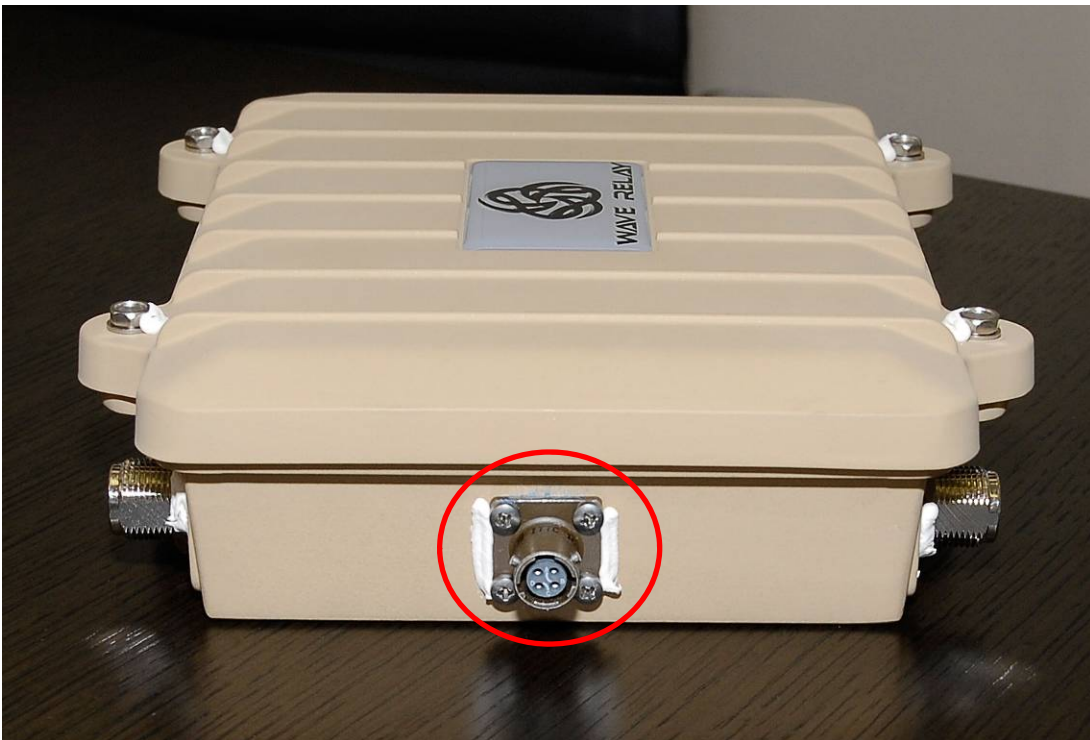
Figure 9 – Tamper-evident material placement for Quad Radio Router Serial Port (Left – 2 locations indicated by the red circle)