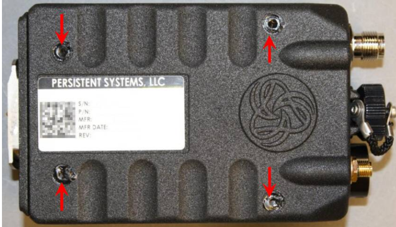
Figure 5 - Tamper-evident material placement for MPU4 (4 locations indicated by red arrows)

Application of the tamper-evident material for the Quad Radio Router is as follows: