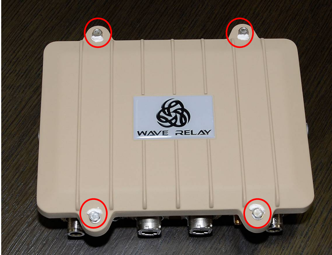
Figure 6 – Tamper-evident material placement for Quad Radio Router Cover (4 locations indicated by red circles)