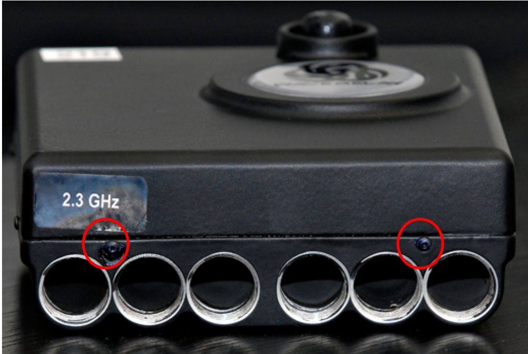
Figure 3 – Tamper-evident material placement for MPU Bottom (2 locations indicated by red circles)