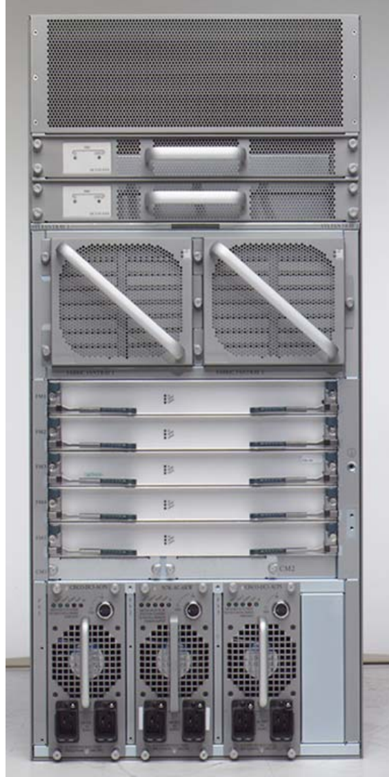
Figure 1 – Front and Back of the Nexus 7000 (10-slot chassis)