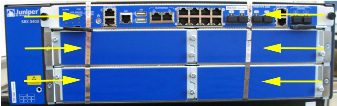
Figure 2. SRX3400 Tamper Evident Seal Location (Top)