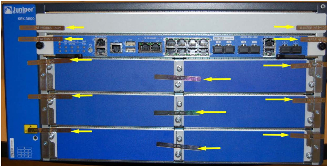
Figure 4. SRX3600 Tamper Evident Seal Location (Front)