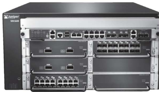
Figure 1 depicts the SRX series without tamper seals. For depictions of the units with tamper seals, see section 9.