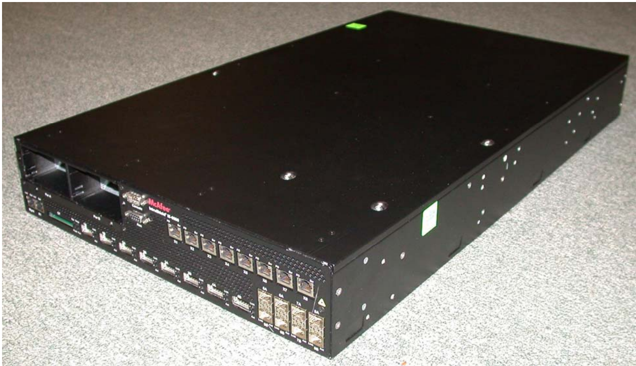
Figure 1 – Image of the Cryptographic Module

Figure 1 shows the module and its cryptographic boundary.