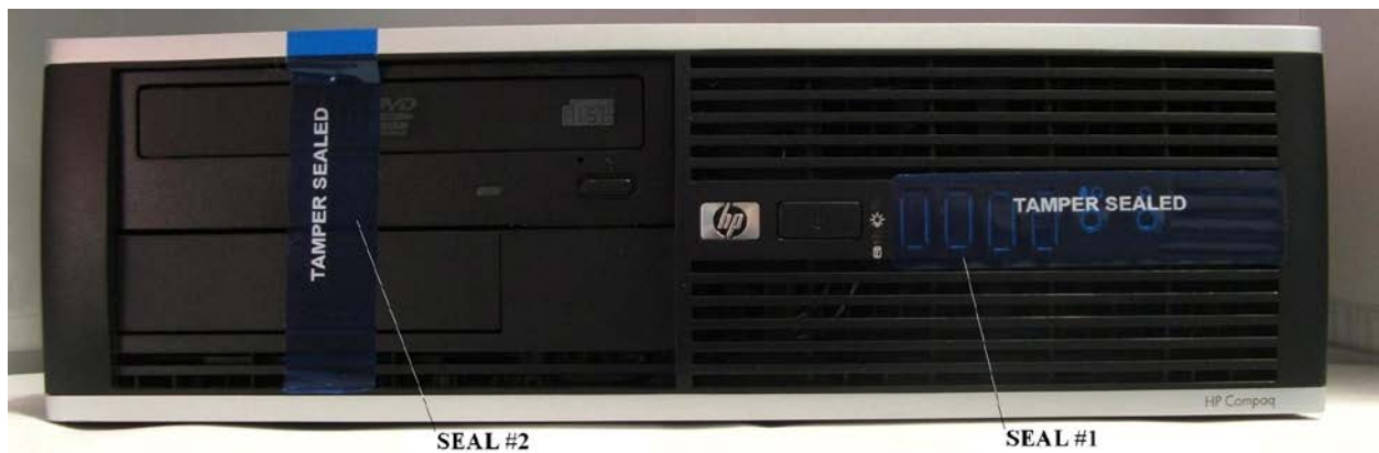
Figure 1 Front

Figures 1, 2 and 3 indicate the exact locations of the tamper evident seals. Note that one seal (#4) is split 2/3 and attached at left and right of the RGB Mini D-Sub 15 PIN Monitor port, to allow the use of this port in FIPS 140-2 mode.