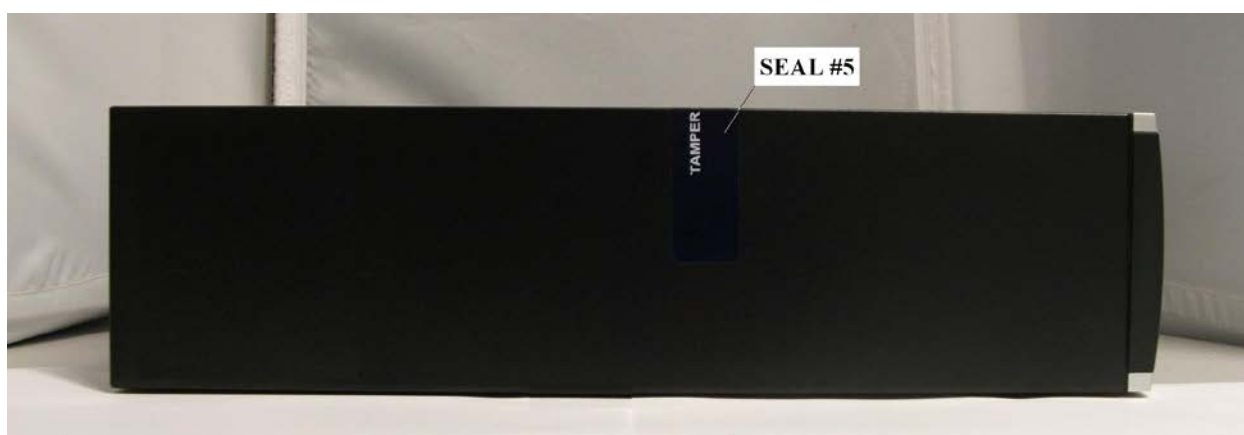
Figure 3 Right Side

There is no tamper evident seal on the left side.