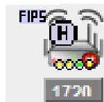
Figure 4 – IntelliComView FIPS failure or Node down icon

This cryptographic module doesn't operate in Non-FIPS mode. Should FIPS mode fail, this cryptographic module sits in an error state shown by flashing ‘status’ LED. IntelliComView (NMS) will not be able to login into the module and status would be represented as shown in Figure 4.