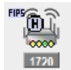
Figure 3- IntelliComView FIPS mode icon

The cryptographic module will enter FIPS Approved mode following successful power up initialization. The cryptographic module will automatically indicate the FIPS Approved mode of operation by the ‘status’ LED turning solid green; FIPS mode can be confirmed by the solid green ‘status’ LED or through IntelliComView (NMS) management software showing “FIPS” on the cryptographic module icon as shown in Figure 3.