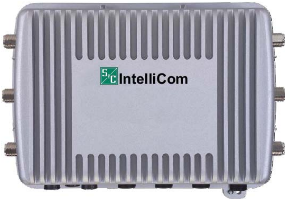
Figure 1 – Image of the Cryptographic Modules: IntelliCom WAN 1720

Note: The antennas are not a part of the cryptographic boundary.