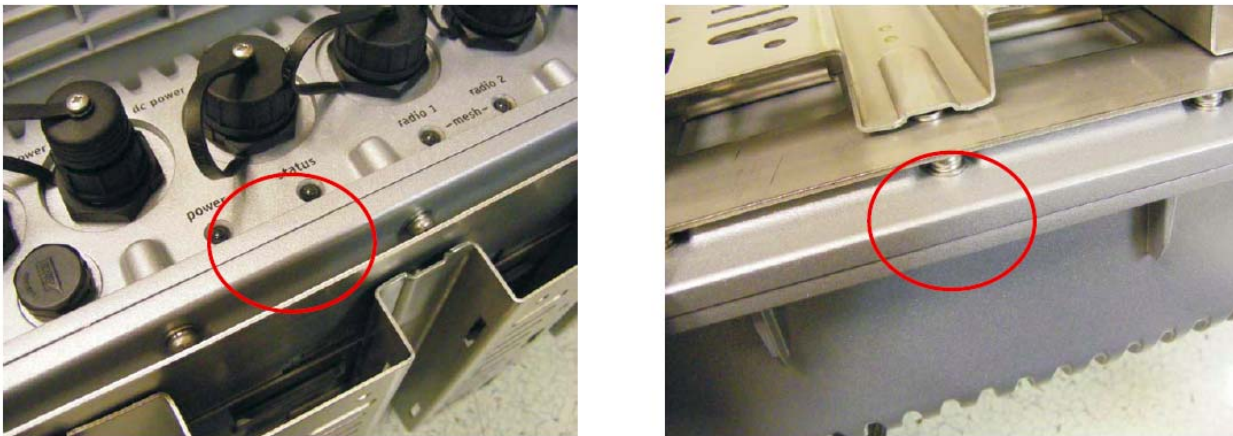
Figure 5 – Location of Tamper Evident Labels (2 Total) for the IntelliCom WAN 1720

The multi-chip standalone cryptographic module is production quality containing standard passivation. S&C IntelliCom WAN 1720 is housed in metal enclosures. Both enclosures are opaque within the visible spectrum and have been designed to satisfy FIPS 140-2 Level 2 physical security requirements. Models IntelliCom WAN 1720 requires tamper evident labels to be applied. It is the responsibility of the Crypto-Officer to apply the labels on the S&C equipment prior to deployment and field use. The labels are serialized. The Crypto-Officer should make a record of the S&C serial number and the corresponding label serial numbers used. The application of the labels is described in Figures 5 – 7.