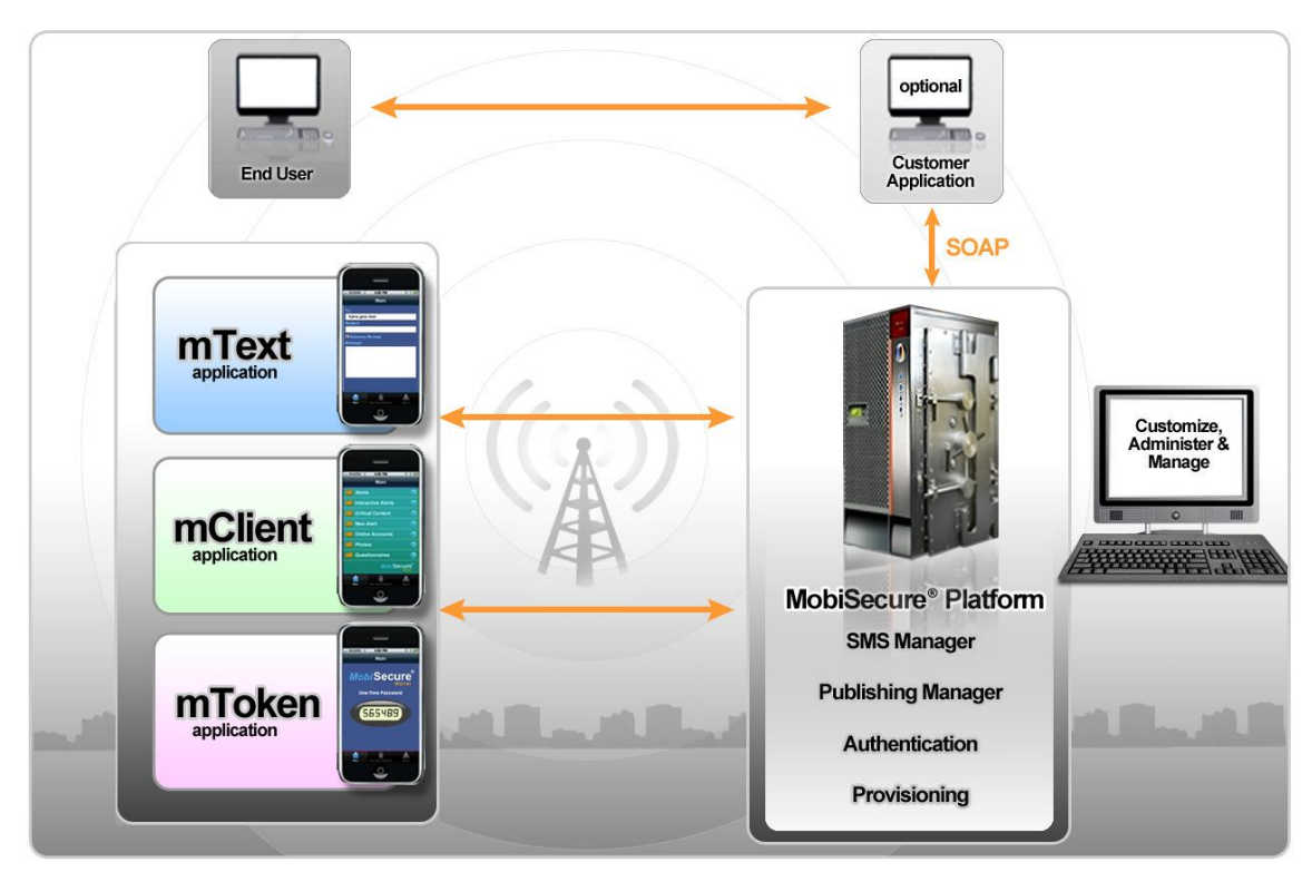
Figure I – Diversinet MobiSecure® Platform

The Diversinet Java Crypto Module is the FIPS validated module that provides cryptographic functionality for the MobiSecure® Platform. The Diversinet Java Crypto Module is validated at the following FIPS 140-2 Section levels: