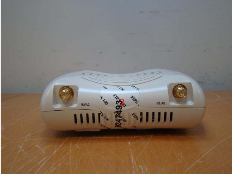
Figure 17 - Aruba AP-104 Tel placement right view