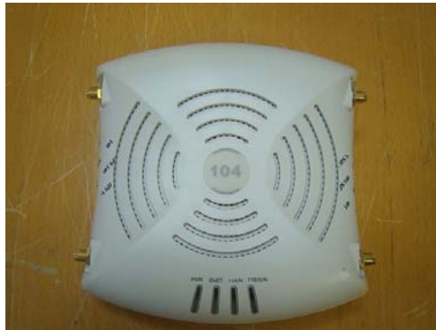
Figure 3 - AP-104 Wireless Access Point

The Aruba AP-104 is high-performance 802.11n (2x2:2) MIMO, dual-radio (concurrent 802.11a/n + b/g/n) indoor wireless access points capable of delivering combined wireless data rates of up to 600Mbps. This multi-function access point provides wireless LAN access, air monitoring, and wireless intrusion detection and prevention over the 2.4GHz and 5GHz RF spectrum. The access point works in conjunction with Aruba Mobility Controllers to deliver high-speed, secure user-centric network services in education, enterprise, finance, government, healthcare, and retail applications.