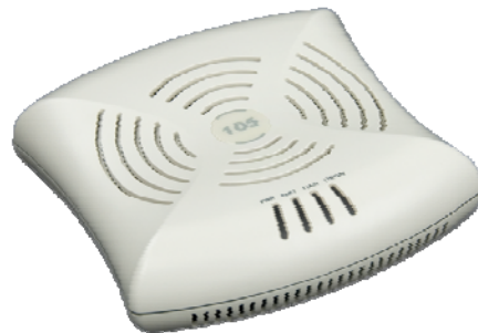
Figure 3 - AP-105 Wireless Access Point

The Aruba AP-105 is high-performance 802.11n (2x2:2) MIMO, dual-radio (concurrent 802.11a/n + b/g/n) indoor wireless access points capable of delivering combined wireless data rates of up to 600Mbps. This multi-function access point provides wireless LAN access, air monitoring, and wireless intrusion detection and prevention over the 2.4GHz and 5GHz RF spectrum. The access point works in conjunction with Aruba Mobility Controllers to deliver high-speed, secure user-centric network services in education, enterprise, finance, government, healthcare, and retail applications.