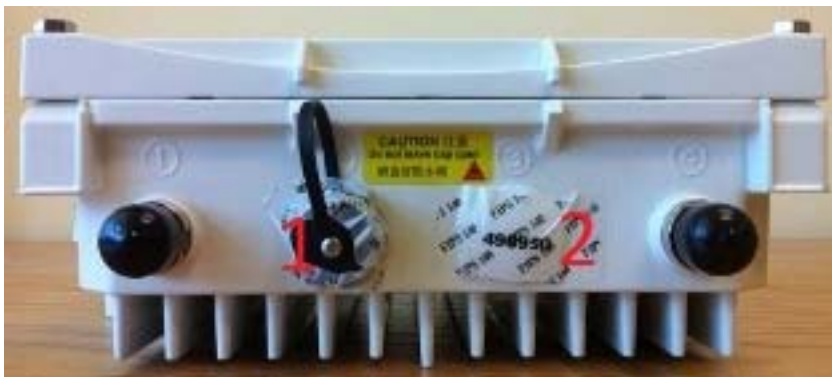
Figure 25 - Aruba AP-175 Tel placement front view

Following is the TEL placement for the AP-175: