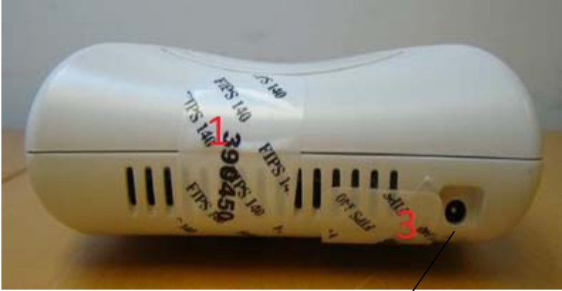
Power Input Inlet