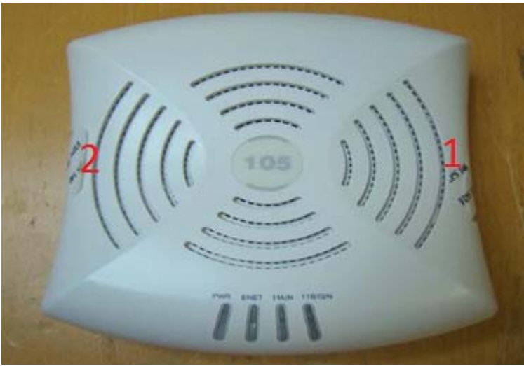
Figure 24 - Aruba AP-105 Tel placement bottom view