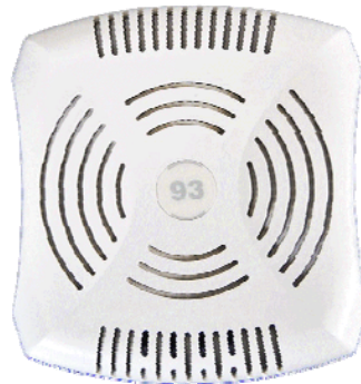
Figure 2 - AP-93 Wireless Access Point

The Aruba AP-93 is robust-performance 802.11n (2x2:2) MIMO, single radio supporting 2.4 GHz or 5 GHz (802.11a/ b/g/n), indoor wireless access points capable of delivering wireless data rates of up to 300Mbps. This multi-function access point provides wireless LAN access, air monitoring, and wireless intrusion detection and prevention. The access point works in conjunction with Aruba Mobility Controllers to deliver high-speed, secure user-centric network services in education, enterprise, finance, government, healthcare, and retail applications.