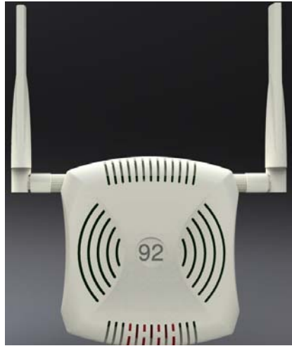
Figure 1 - AP-92 Wireless Access Point

The Aruba AP-92 is robust-performance 802.11n (2x2:2) MIMO, single radio supporting 2.4 GHz or 5 GHz (802.11a/ b/g/n), indoor wireless access points capable of delivering wireless data rates of up to 300Mbps. This multi-function access point provides wireless LAN access, air monitoring, and wireless intrusion detection and prevention. The access point works in conjunction with Aruba Mobility Controllers to deliver high-speed, secure user-centric network services in education, enterprise, finance, government, healthcare, and retail applications.