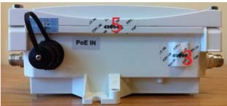
Figure 29 - Aruba AP-175 Tel placement top view