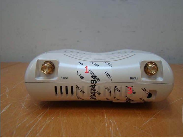
Figure 18 - Aruba AP-104 Tel placement top view