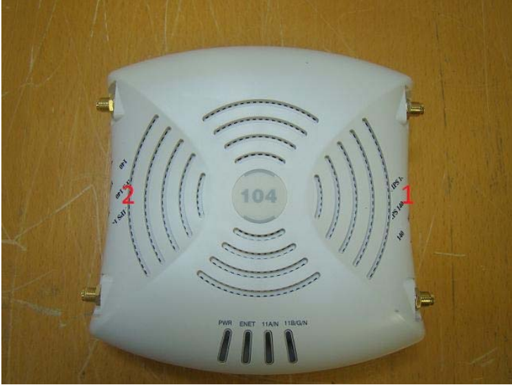
Figure 19 - Aruba AP-104 Tel placement bottom view