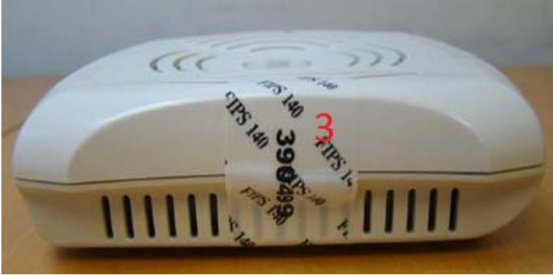
Figure 13 - Aruba AP-93 Tel placement bottom view