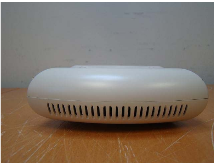
Figure 16 - Aruba AP-104 Tel placement left view