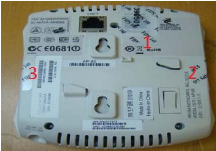
Figure 14 - Aruba AP-93 Tel placement top view