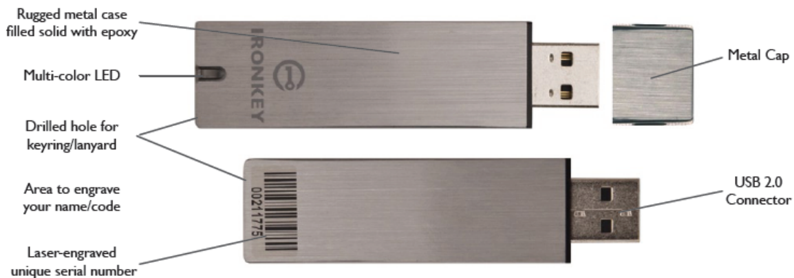
Figure 1 – Image of the Cryptographic Module (S250)

The cryptographic boundary is defined as being the outer perimeter of the metallic enclosure and is depicted below.