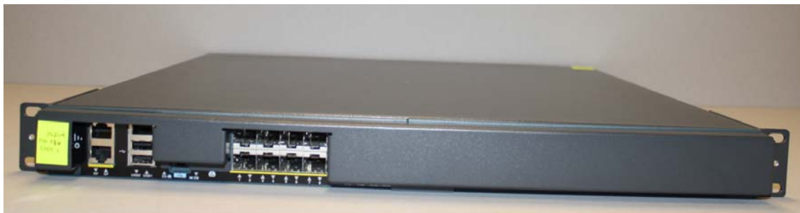
Figure 1 Entire Module

The module automatically detects, authorizes and configures access points, setting them up to comply with the centralized security policies of the wireless LAN. In a wireless network operating in this mode, WPA2 protects all wireless communications between the wireless client and other trusted networked devices on the wired network with AES-CCMP encryption. CAPWAP protects all control and bridging traffic between trusted network access points and the module with DTLS encryption.