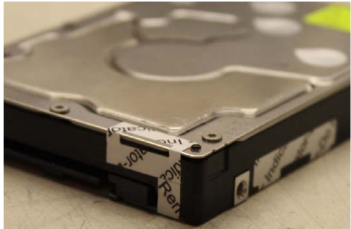
Figure 3: Smaller Tamper Evident Label