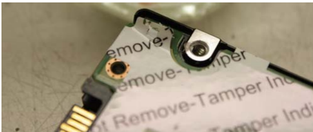
Figure 4: Tamper Evidence on Large Tamper Label

The Cryptographic Officer and/or User shall inspect the Cryptographic Module enclosure for evidence of tampering a minimum of once a year.