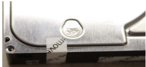
Figure 5: Tamper Evidence on Metal Surface