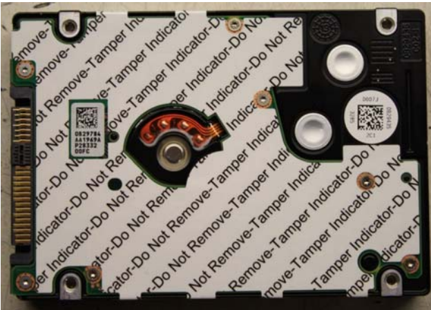
Figure 2: Large Tamper-Evident Label