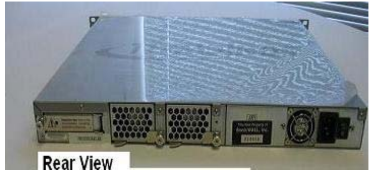
Figure 6: NSA E6500 Rear