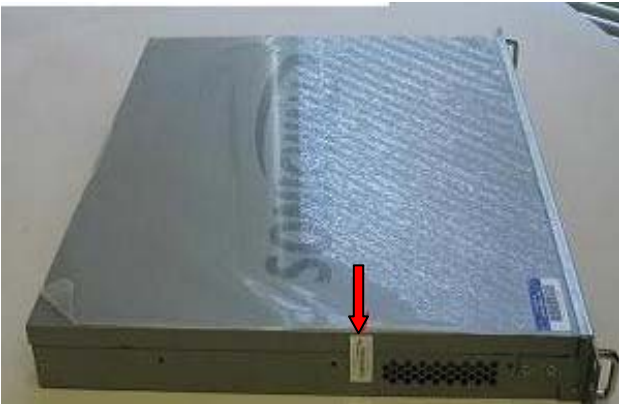
Figure 3: Tamper Evident Seal

The chassis is sealed with three tamper-evident seals, which are applied during manufacturing. The physical security of the module is intact if there is no evidence of tampering with the seals. The locations of the tamper-evident seals are indicated by the red arrows in Figures 1 and 2 below: