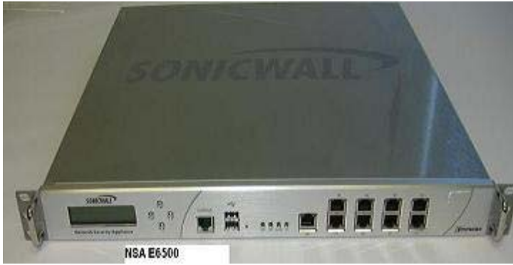
Figure 5: NSA E6500 Front