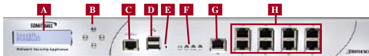
Figure 1 – NSA E6500 Front Panel

Figure 1 shows the locations of the physical ports on the front of the module.