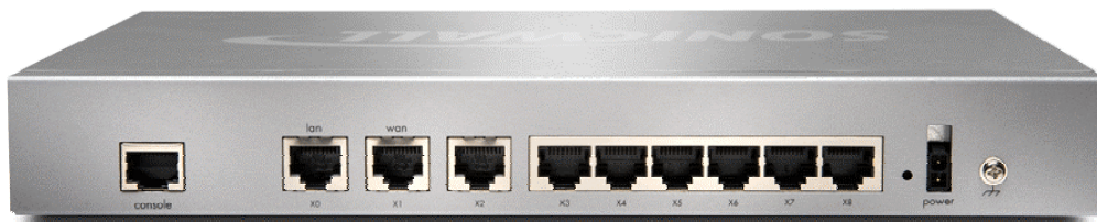
Figure 4 – NSA 240 Back