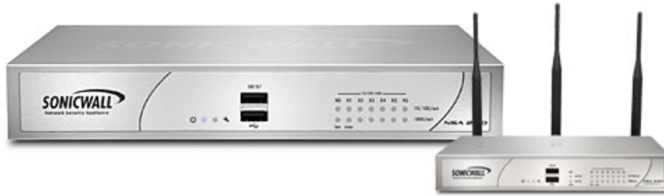
Figure 5 – NSA 220 Front (at Left) and NSA 220W Front (at Right)