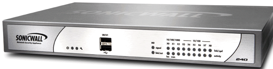
Figure 3 – NSA 240 Front

The Cryptographic Boundary includes the entire device.