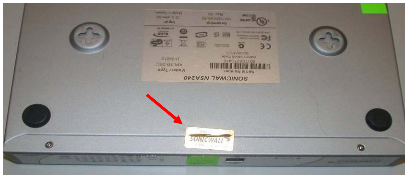
Figure 6 – Tamper Seal Location (220/220W/240 - Bottom)

The chassis is sealed with one tamper evident seal, which is applied during manufacturing. The physical security of the module is intact if there is no evidence of tampering with the seal. The location of the tamper evident seal is indicated by the red arrow in Figure 4 below: