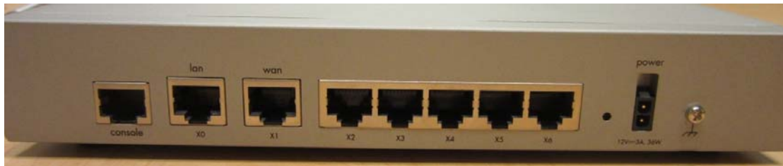
Figure 2 – NSA 220/220W Back

The chassis is sealed with one tamper evident seal, which is applied during manufacturing. The physical security of the module is intact if there is no evidence of tampering with the seal. The location of the tamper evident seal is indicated by the red arrow in Figure 4 below: