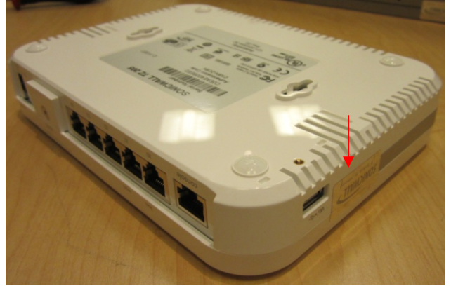
Figure 6 – TZ 205 Tamper Evident Seal