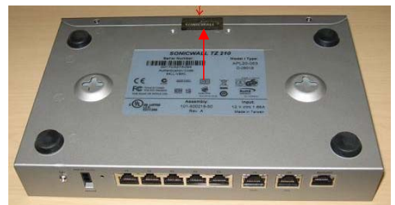
Figure 10 – TZ 210 Tamper Evident Seal