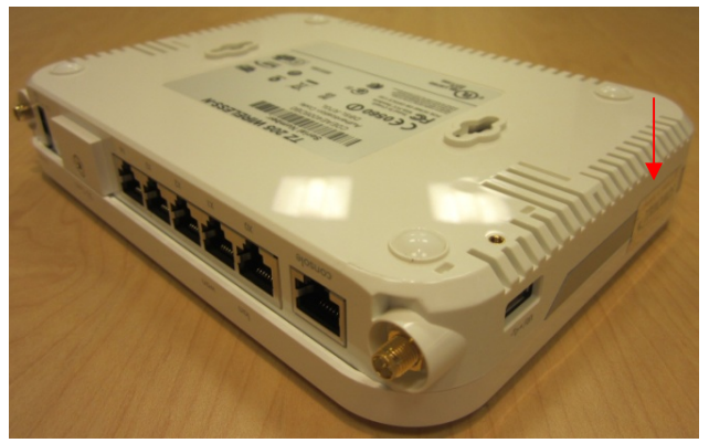
Figure 8 – TZ 205W Tamper Evident Seal

Note: The tamper-evident seal is in the same location on the TZ 210, TZ 210W, TZ 215, and TZ 215W.