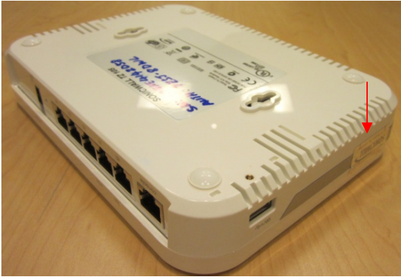
Figure 2 - TZ 105 Tamper Evident Seal