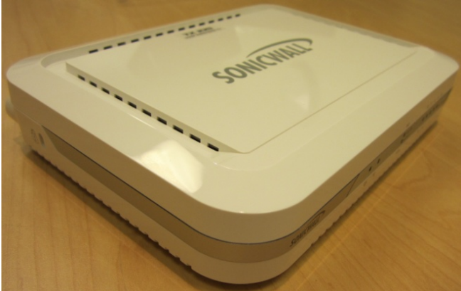
Figure 3 – TZ 105W