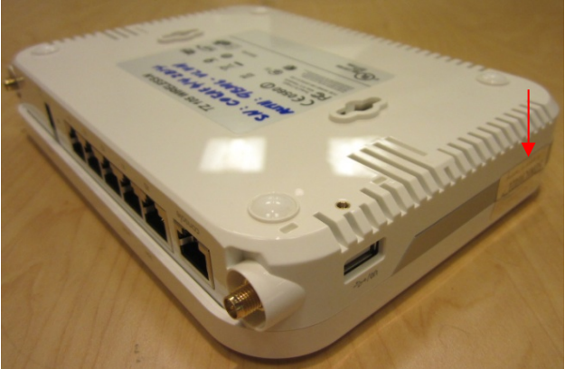
Figure 4 – TZ 105W Tamper Evident Seal