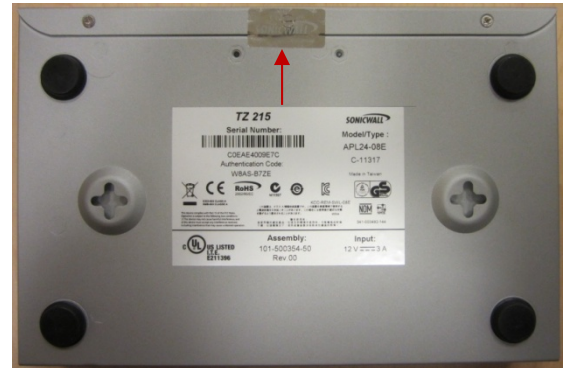
Figure 16 – TZ 215W Tamper Evident Seal