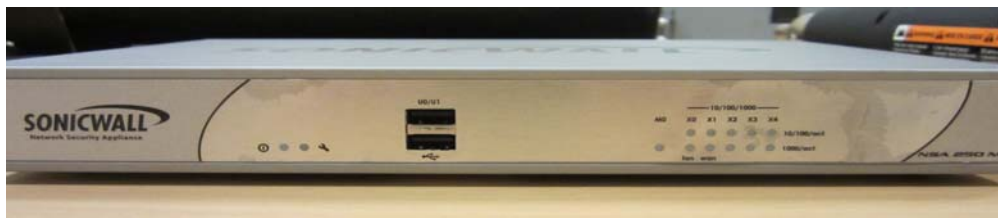
Figure 5 – NSA 250M Front