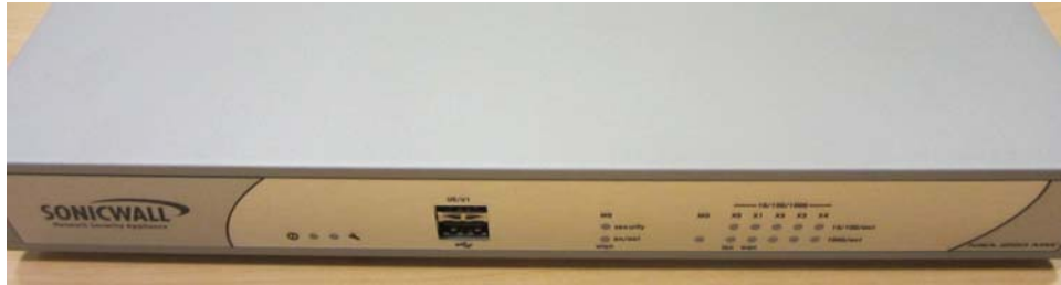
Figure 3 – NSA 250MW Front

The cryptographic boundary includes the entire device.