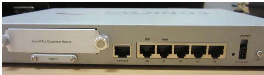
Figure 6 – NSA 250M Rear

The chassis is protected with one (1) tamper-evident seal, which is applied during manufacturing. The physical security of the module is intact if there is no evidence of tampering with the seal. The location of the tamper-evident seal is indicated by the arrow in Figure 1.