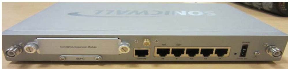
Figure 4 – NSA 250MW Rear