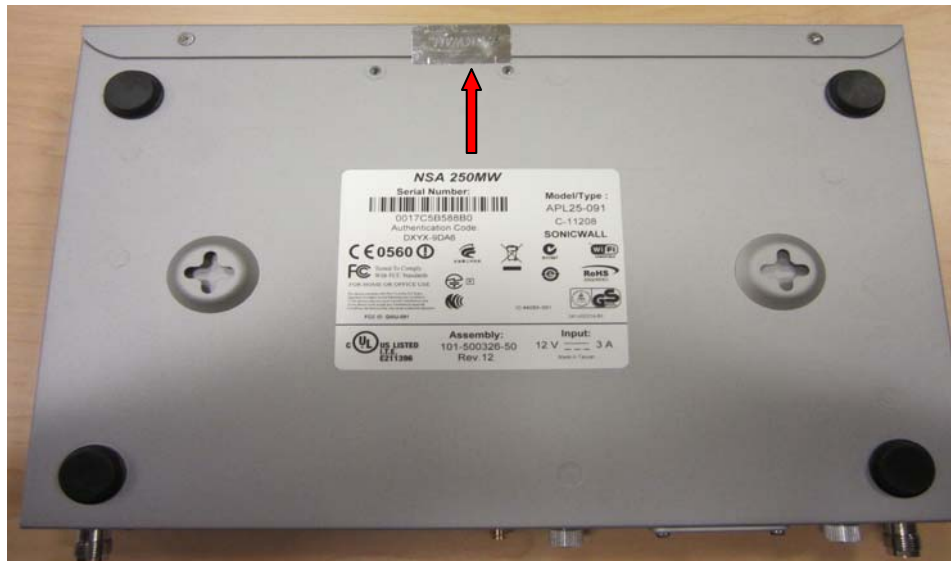
Figure 7 – NSA 250M/MW Tamper-Evident Seal