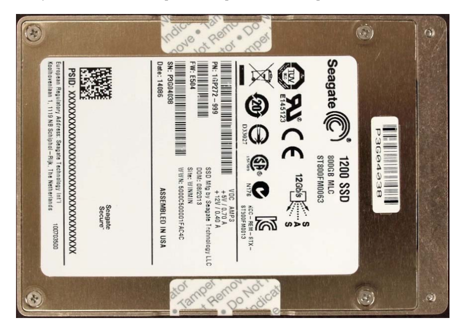
Figure 1: Top view of tamper-evidence label on sides of drive