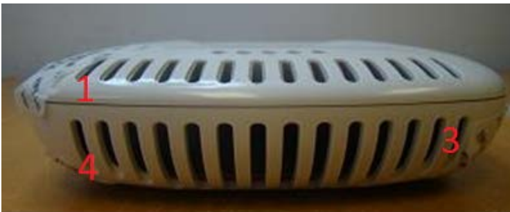
Figure 7: AP-135 Front view

Following is the TEL placement for the AP-135: