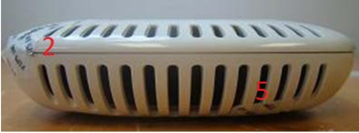
Figure 8: AP-135 Back view