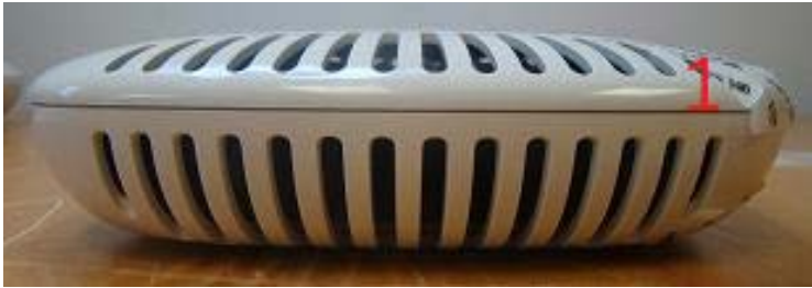
Figure 9: AP-135 Left view