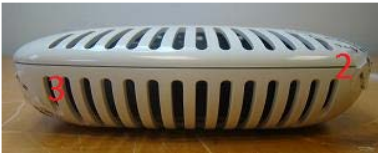
Figure 10: AP-135 Right view