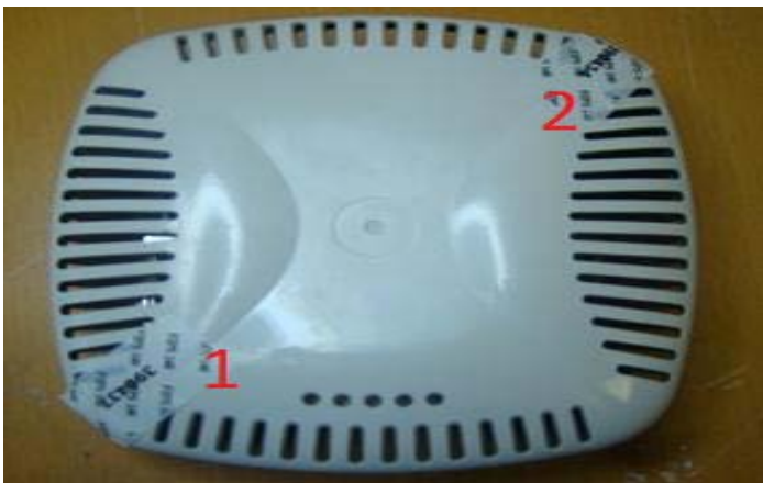
Figure 11: AP-135 Top view