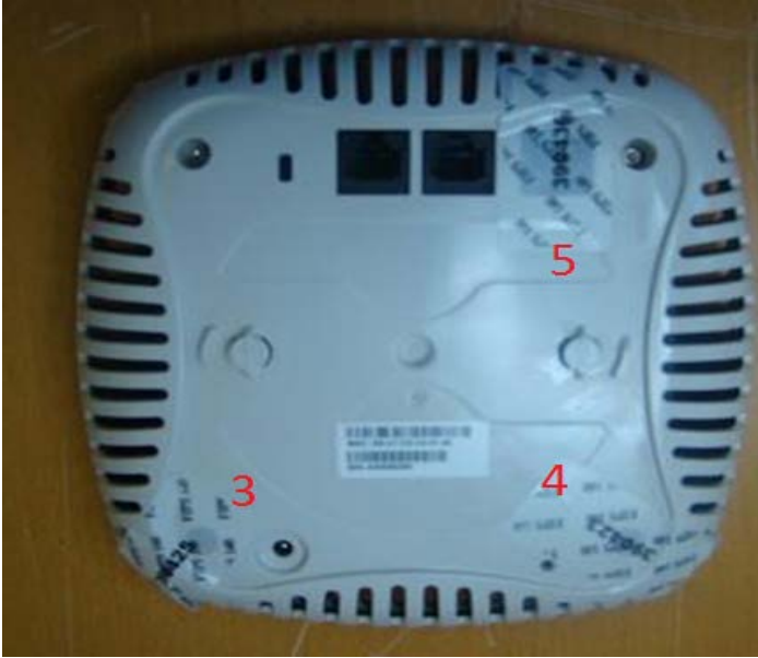
Figure 12: AP-135 Bottom View