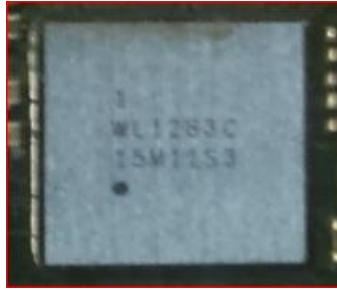
Figure 1 – Module Hardware Component

Physical Cryptographic Boundary is the mobile computer that integrates the Module. The module’s hardware component is depicted in Figure 1. Figure 2 shows two (2) different connectivity chips that integrates Texas Instruments’ WL1283 chipset (The module’s hardware component), highlighted in red. Mobile Computers using TI OMAP4 Android Jelly Bean 4.1.1 or Android KitKat 4.4.4 based platform use one of the below connectivity chips shown in Figure 2.