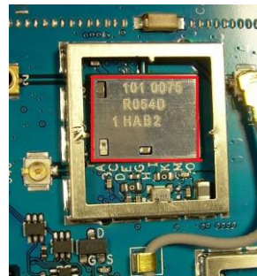
Figure 2 – Module Hardware Component Integrated to Connectivity Chip