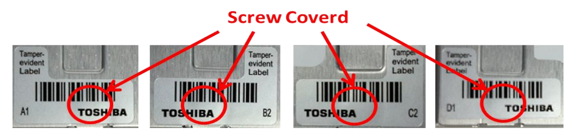
CORNER SEAL A CORNER SEAL B CORNER SEAL C CORNER SEAL D (PX02SMU020/040/080)