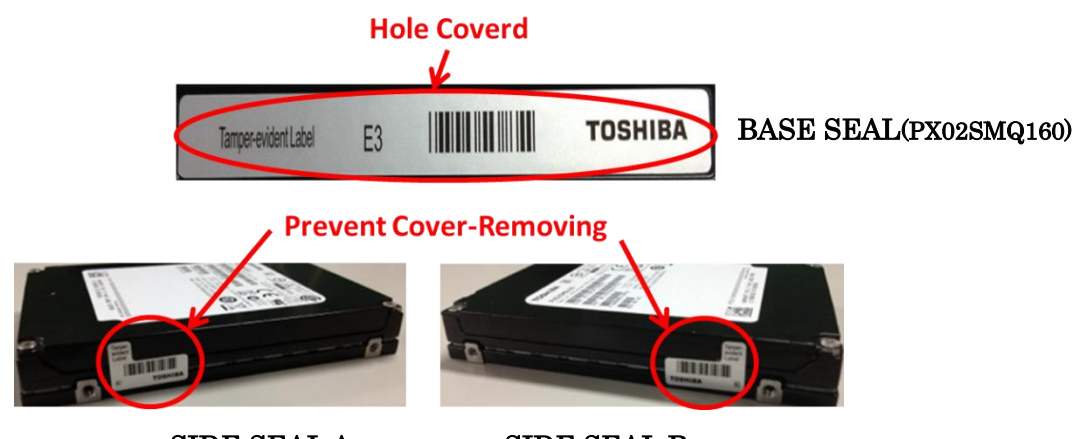
SIDE SEAL A SIDE SEAL B (PX02SMQ160)