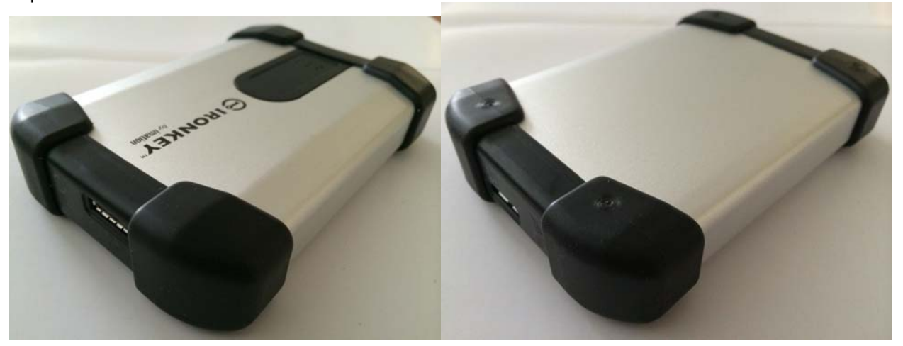
Figures 1 & 2 – Images of the Cryptographic Module w/ Excluded Case

The cryptographic boundary is defined as being the outer perimeter of the metallic enclosure and is depicted below.