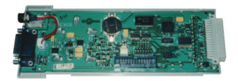
Figure 2 Digital Interface Unit Cryptographic Module (Cover Removed)

The DIU CM is implemented as a multi-chip embedded cryptographic module as defined by FIPS 140-1. It is comprised of the Armor Cryptographic Processor, Flash memory, key zeroization circuitry, tamper circuitry, power regulation, and on board back-up battery all enclosed in a tamper protected housing.