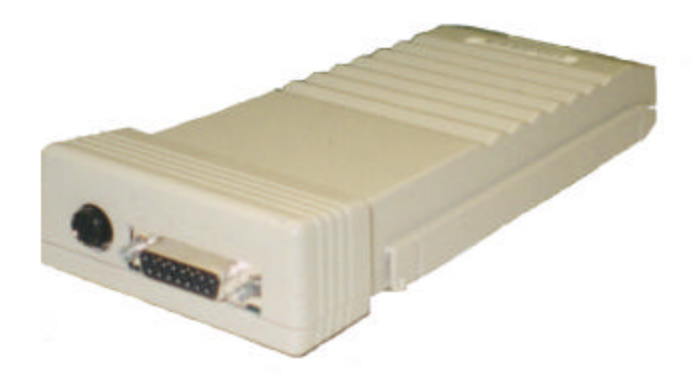
Figure 1 Digital Interface Unit Cryptographic Module

The DIU CM provides secure voice and Over-the-Air-Rekeying (OTAR) advanced key management for Motorola's Digital Interface Unit (DIU). The DIU and DIU CM combine to provide these cryptographic services for Motorola's APCO-25 compliant Astro <sup>TM</sup> family of console and base station radio infrastructure equipment.