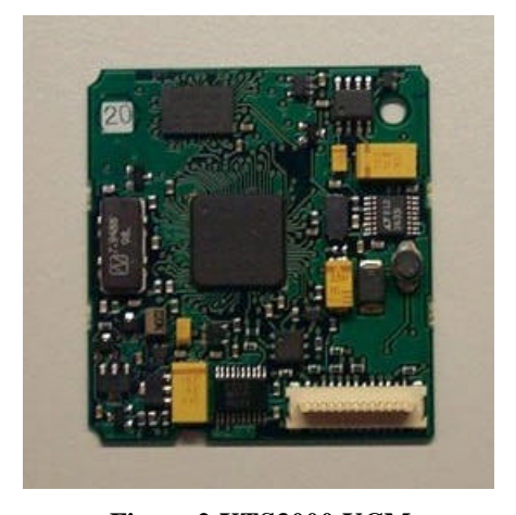
Figure 2 XTS3000 UCM