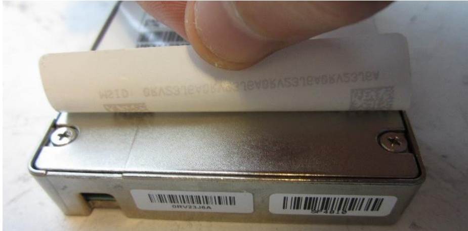
Figure 3 - Lift top label