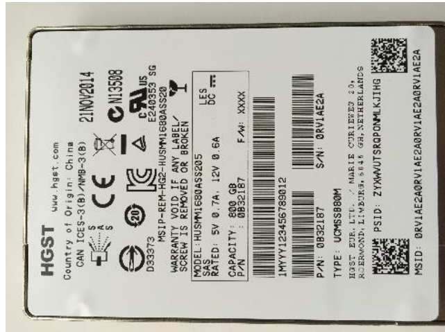
Figure 2 Large Tamper-Evident Label on Top Surface

The Cryptographic Module does not make claims in the Physical Security area beyond FIPS 140-2 Security Level 2.