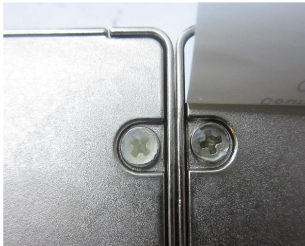
Figure 4 - Left side shows tamper. Right side shows no tamper.