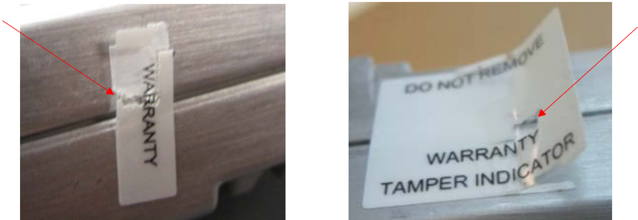
Figure 3: Tamper Evidence on Tamper Seals