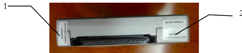
Figure 2: Tamper-Evident Seals