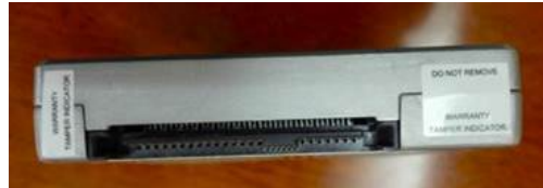
SAS Connector Front View