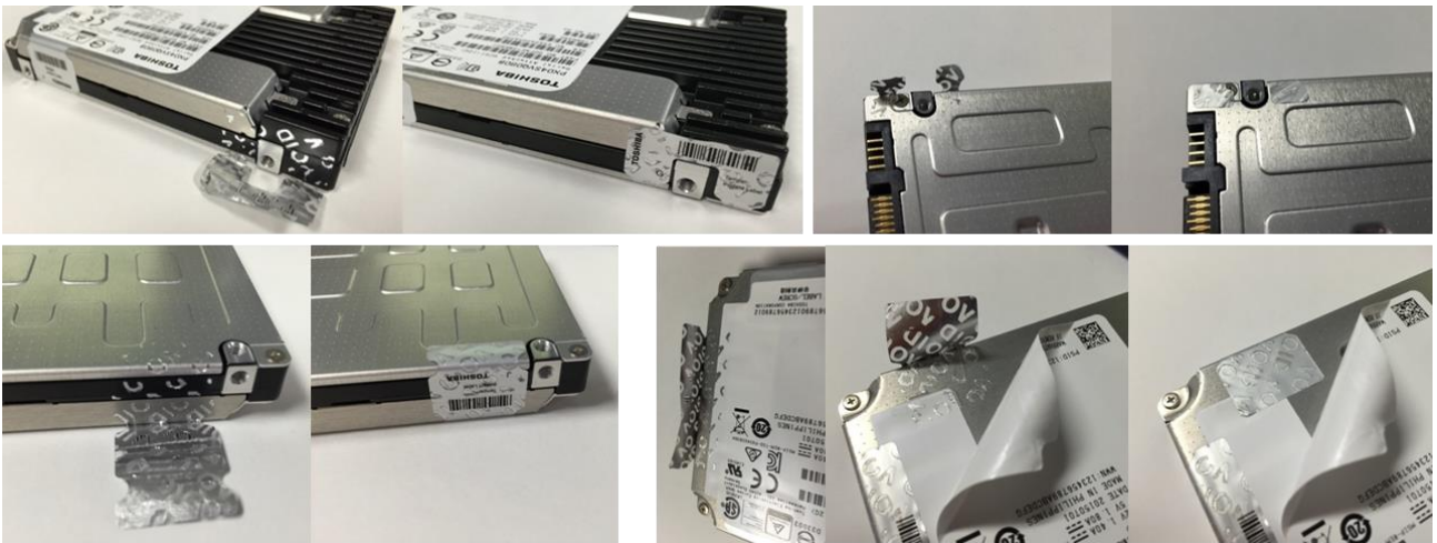
Mark of alphabetic character(s) which constitute a word “VOID”