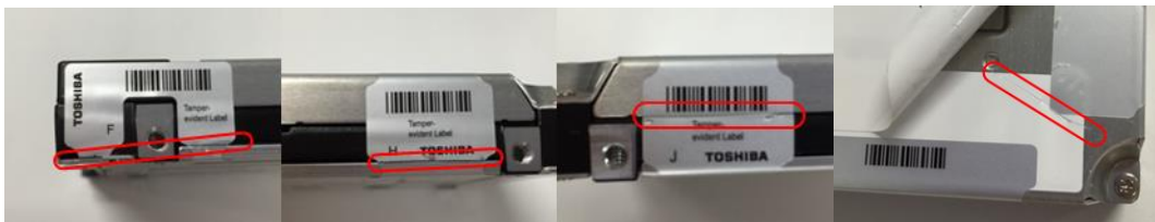
Cutting line (Security seals and OUTER SHEET)