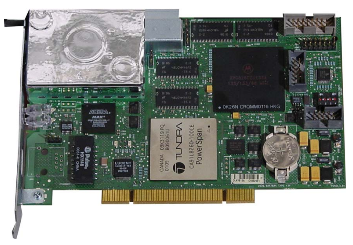
Figure 1 Key Management Facility Crypto Card

The KMF CC provides encryption and decryption services for secure key management and Over-the-Air-Rekeying (OTAR) for Motorola's Key Management Facility (KMF). The KMF and KMF CC combine to provide these cryptographic services for Motorola's APCO-25 compliant Astro <sup>TM</sup> radio systems.