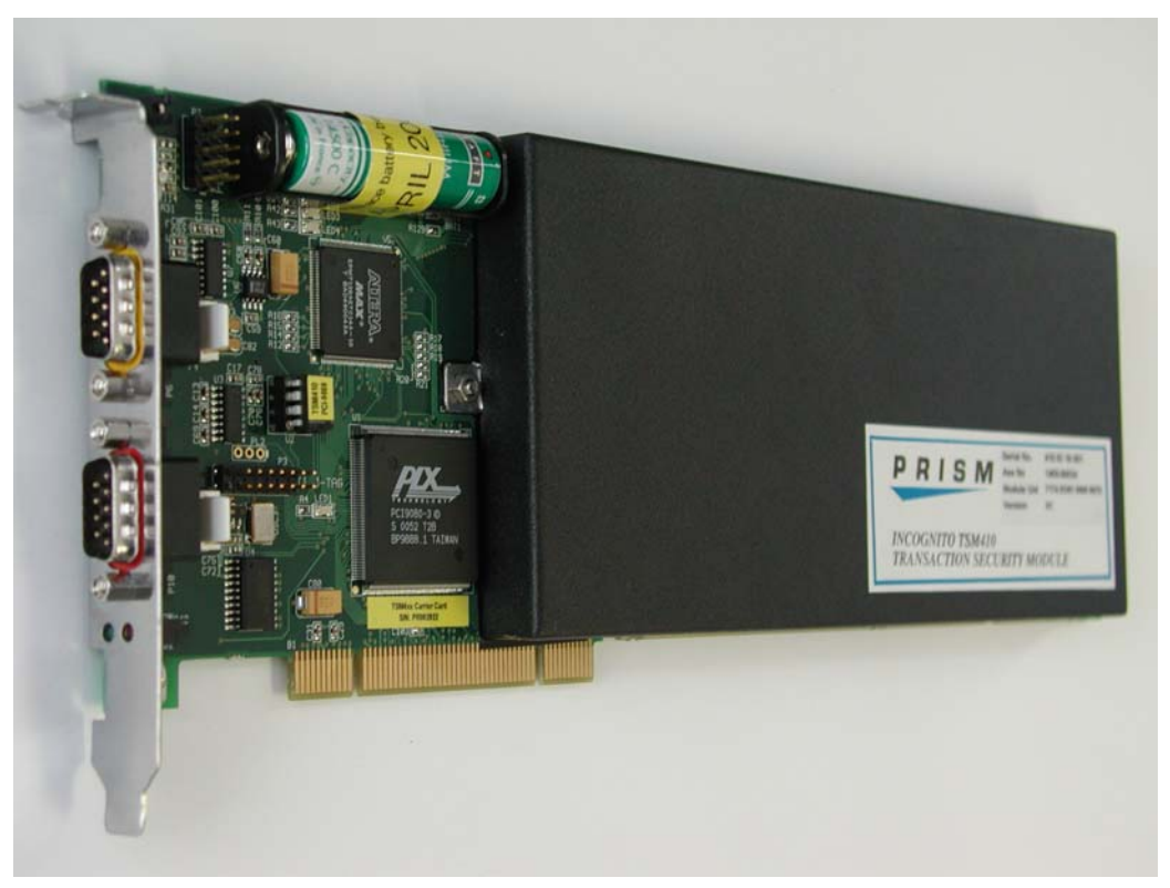
Figure 1. Incognito TSM410 on its PCI carrier card

Figure 1 is a photographic image of the Incognito TSM410. A block diagram of the module indicating the functional components, cryptographic boundary and physical interfaces is presented in Figure 2 (on page 8).