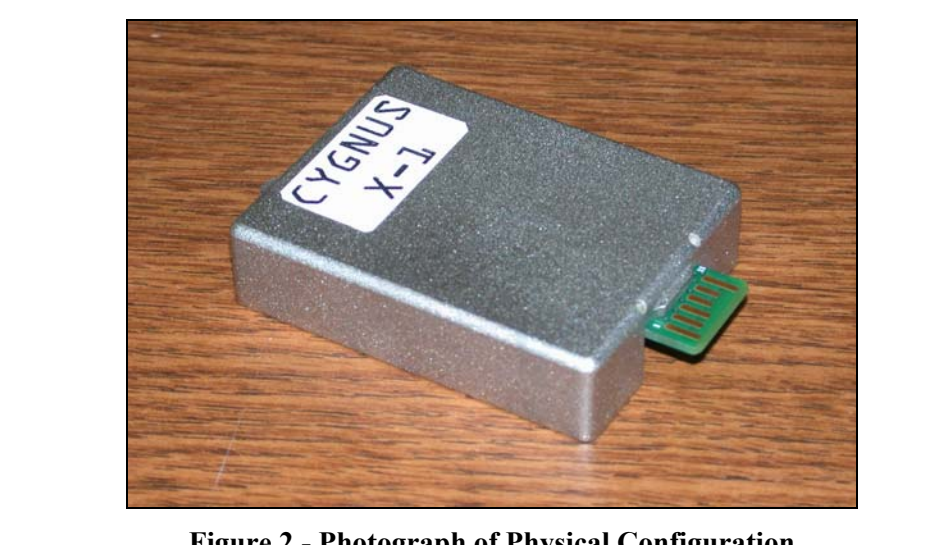
Figure 2 - Photograph of Physical Configuration