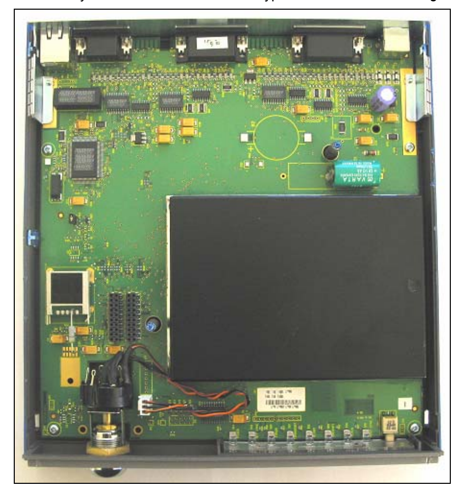
Figure 1-2 Datacryptor® 2000 Internal Layout

The DC2K Security Module installed in a Datacryptor® 2000 is shown in Figure 1-2.