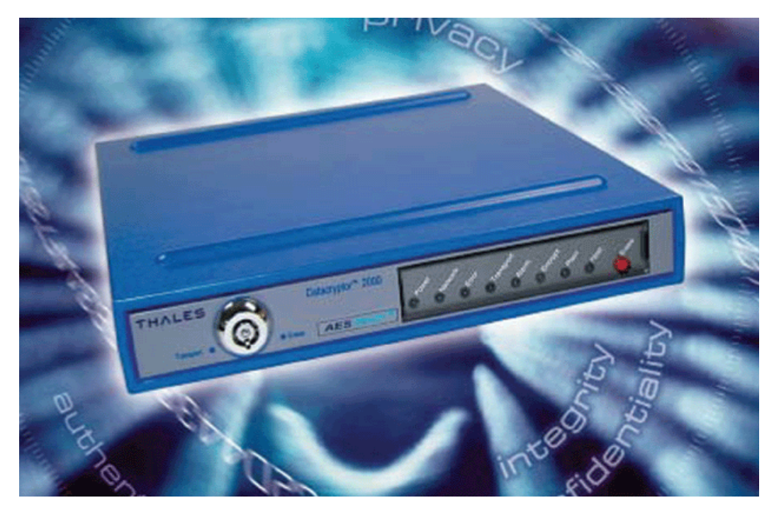
Figure 1-1 Datacryptor® 2000

Further information on the Datacryptor® 2000 and the functionality provided by the DC2K Security Module is available from the Thales web site: <a href="http://www.thales-esecurity.com">http://www.thales-esecurity.com</a>