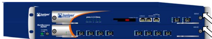
Location of Tamper Evident Seals