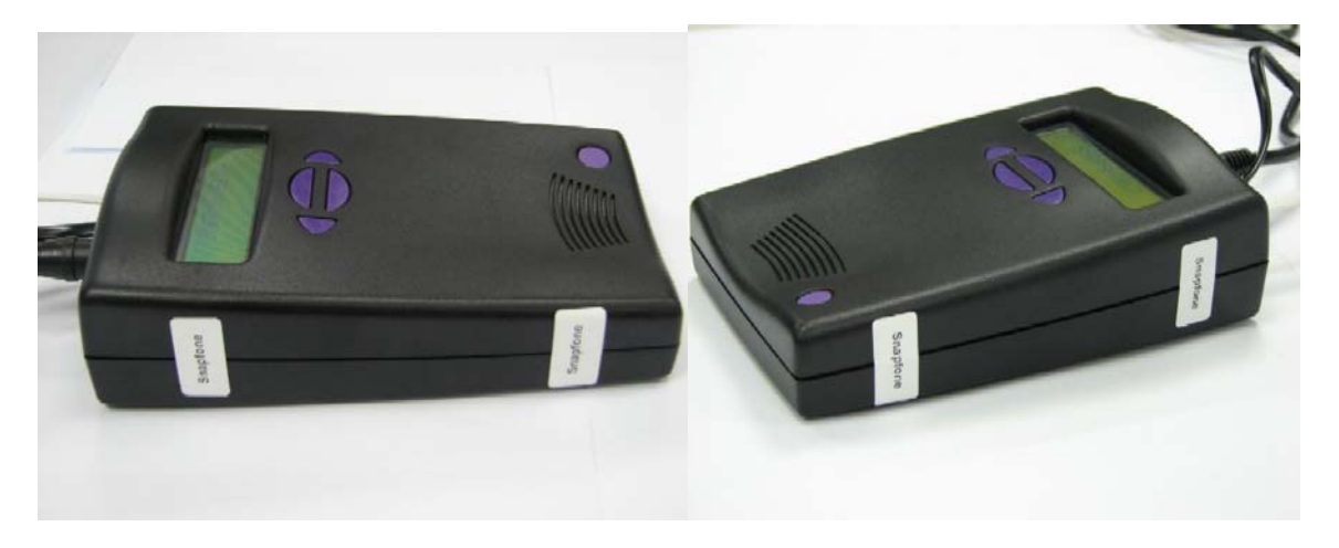
Figure 2 – SNAPfone Label Placement

SNAPfone uses an enclosure that is opaque within the visible spectrum. Tamper evident labels are used to detect tamper attempts.