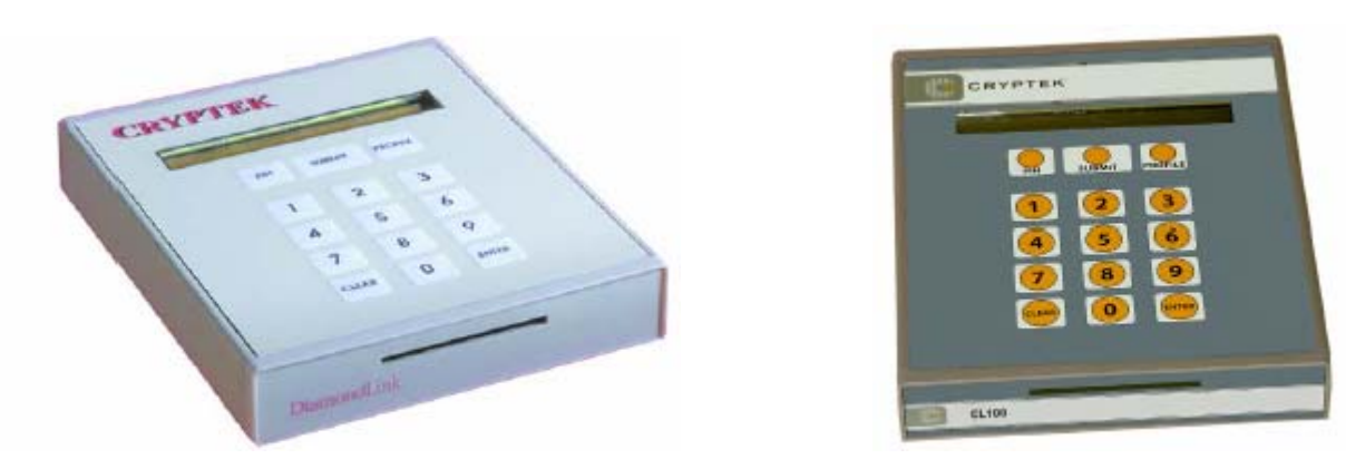
Diagram 1 – Photograph of the DiamondLink and CL100

The design provides a status output and input interface, individual host and network interfaces, and an authentication interface. The authentication interface consists of an integrated keypad and card reader. The integrated LCD provides status output for the user.