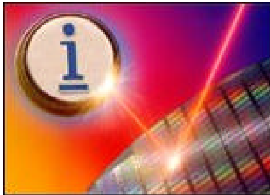
Figure 1 – The DS1954B Crypto i Button™ is laser-engraved in steel and silicon

The Crypto i Button provides hardware cryptographic services such as secure private key storage, a high-speed math accelerator for 1024-bit public key cryptography, and secure message digest (hashing). In FIPS 140-1 terminology the Crypto i Button is a “multi-chip standalone cryptographic module”; however, the Crypto i Button actually provides all its services using a single silicon chip packaged in a 16mm stainless steel case. Thus, the i Button can be worn by a person or attached to an object for up-to-date information at the point of use. The steel button is rugged enough to withstand harsh outdoor environments, and is durable enough for a person to wear everyday on a digital accessory like a ring, key fob, wallet, or badge.