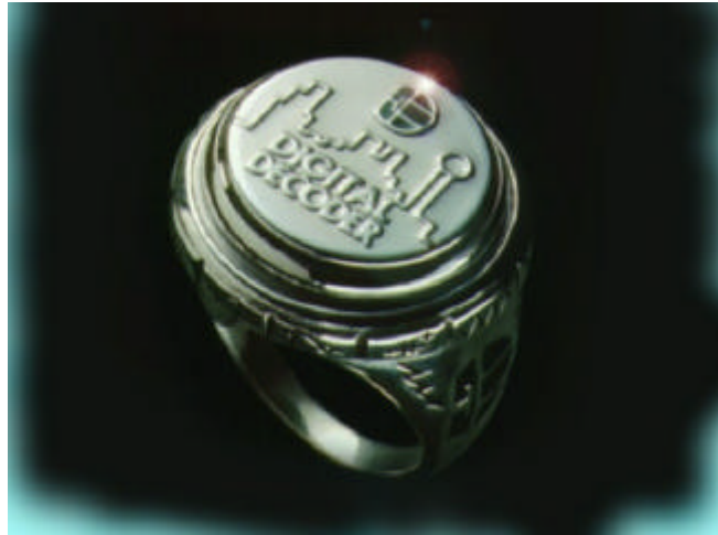
Figure 4 – The Crypto iButton Mounted as a Signet Jewel of a Ring. It can be attached to any personal accessory

iButton will stand up to the harsh conditions of daily wear, including dropping it, stepping on it, and inadvertently passing it through the washing machine and dryer.