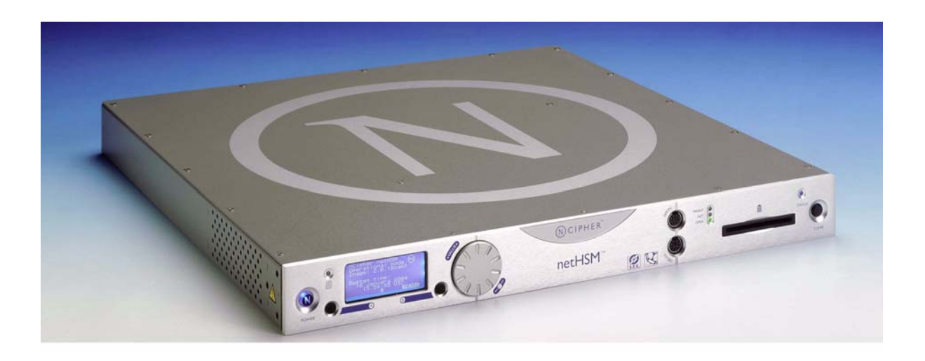
The following figure shows the module mounted inside the NetHSM