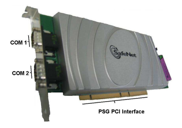
Figure 1 - The PSG

Please note that the difference between hardware revision B2 and hardware revision B3 is that hardware revision B2 contains components that are not RoHS¹ compliant while hardware revision B3 contains RoHS-compliant components. Hardware revision B4 differs from hardware revision B3 in that a filter circuit has been replaced with a jumper. Functionally, all hardware revisions are identical.