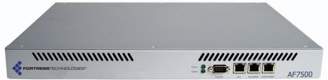
Figure 3: Front View of the AF7500 Hardware