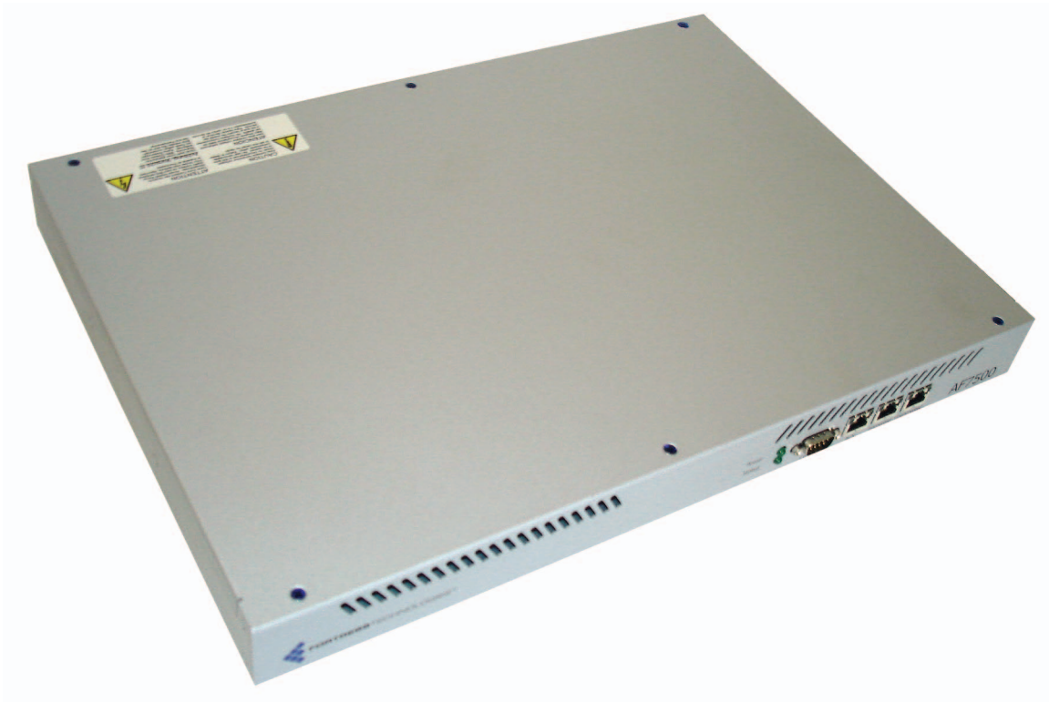
Figure 4: Top and Front View of the AF7500 Hardware Showing the Blue Thread Locker