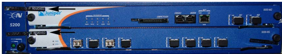
Fig. 2: Tamper Evident Mechanisms, Front of NetScreen-5200