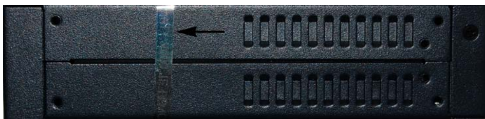
Figure 5: Side of both SSG 5 and 20 devices, with location of tamper evident seal