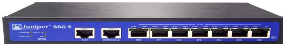
Figure 1: Front of the SSG 5 device