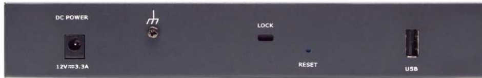
Figure 2: Rear of the SSG 5 device