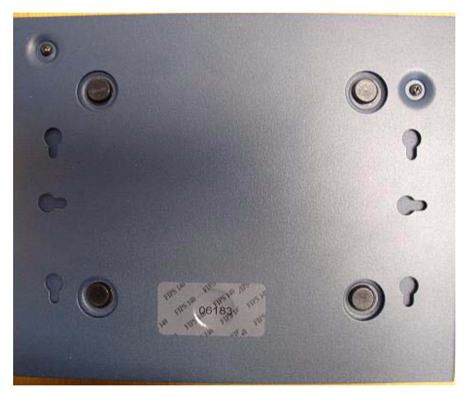
Figure 2 Bottom View of Rack-Mountable Enclosure with Tamper Evidence Label Placement