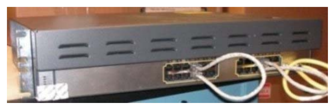
Figure 1 Placement of Opacity shields

A cap must be placed on the mode button in order to prevent it from being pressed. Figure 2 shows the placement of the cap.