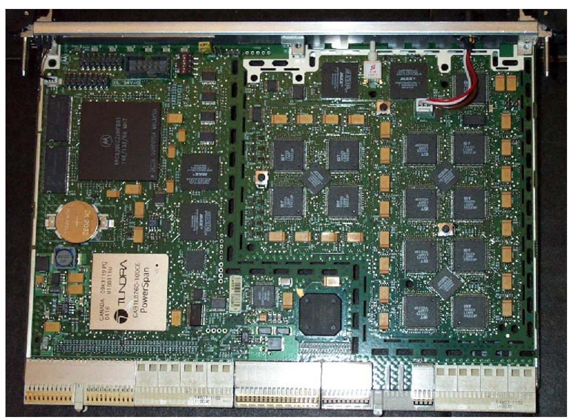
Figure 1: MGEG SCCE front w/o tamper shield. Crypto boundary defined by dashed 'line'.