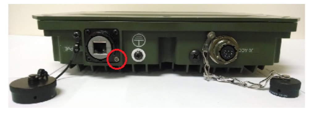
Figure 4 – Tamper-Evident Pin Location for RF-7800W