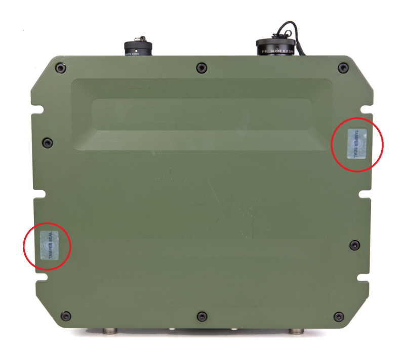
Figure 3 – Tamper-Evident Label Locations for RF-7800W