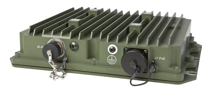
Figure 1 – Harris RF-7800W Broadband Ethernet Radio

The lightweight RF-7800W is easy to configure and deploy. Using a standard Web browser, an operator has access to all required configuration items and statistics necessary to configure and monitor the operation of the radio. Third-party network management applications can also be utilized via the standard Simple Network Management Protocol (SNMP) interface. Although SNMPv3 can support AES encryption in CFB mode the module firmware has been designed to block the ability to view or alter critical security parameters (CSPs) through this interface. Also note that the SNMPv3 interface is a management interface for the Harris devices and that no CSPs or user data are transmitted over this interface.