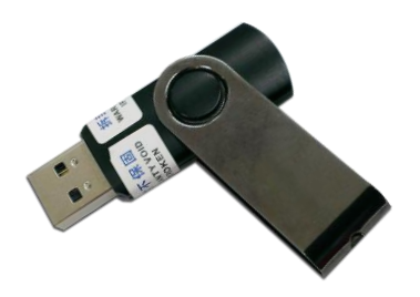
Figure 1. Physical view of the HiKey PKI Token.

The HiKey PKI Token is a multiple-chip implementation of a cryptographic module. Figure 1 shows a physical view of the module.