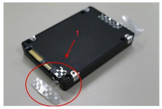
Exhibit 14 – Signs of Tamper