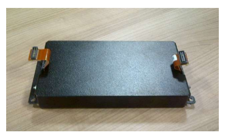
Figure 2 - 2870-G1 Module

Like its predecessors, the ACCE, ACCE-L3 and ACCE v2 modules, the ACCE v3 exists to provide cryptographic services to applications running on behalf of its user which communicate with it via a standard Ethernet interface using IP protocols. To implement these services, the module additionally requires a suitable power supply, Smart Card reader, USB port, digital display device, keypad and line drivers.