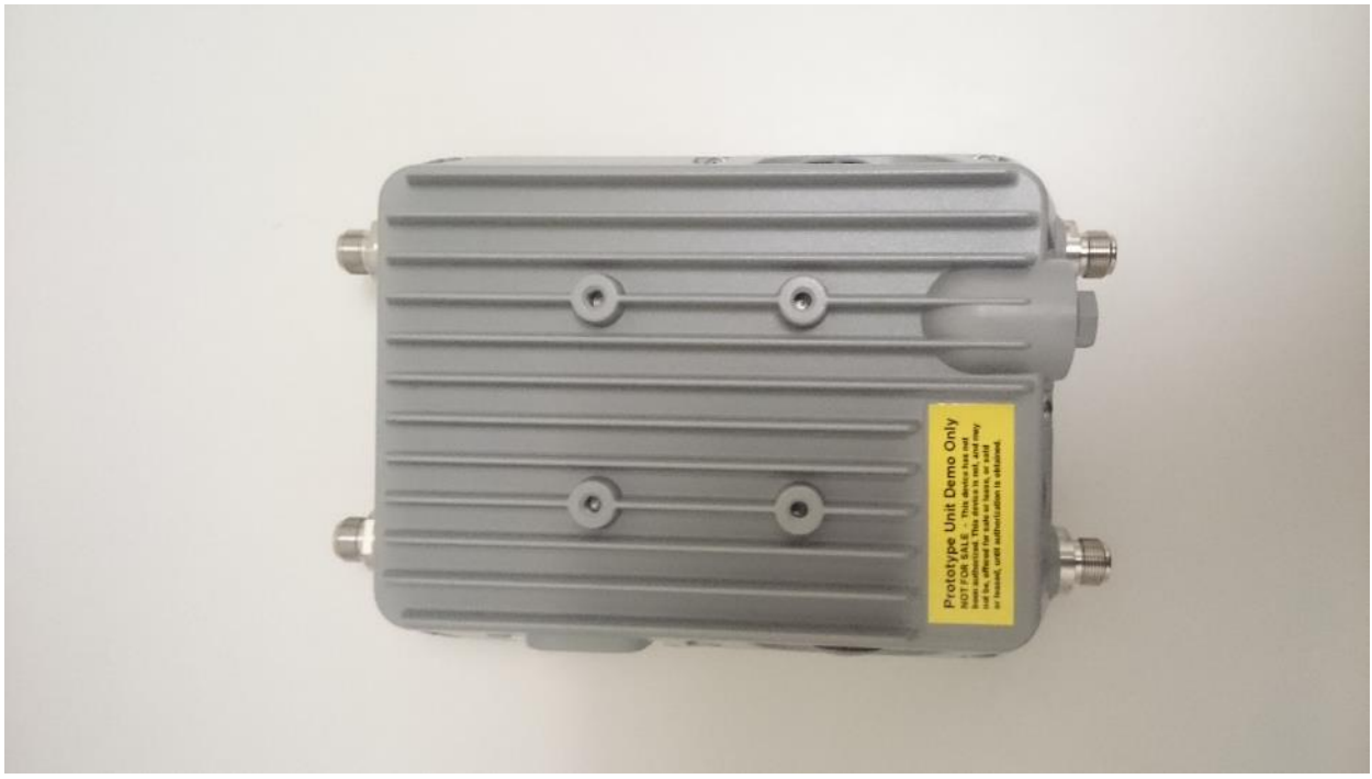
Cisco Aironet 1562e/d/ps (Front, Back, Left, Right, Top, Bottom)