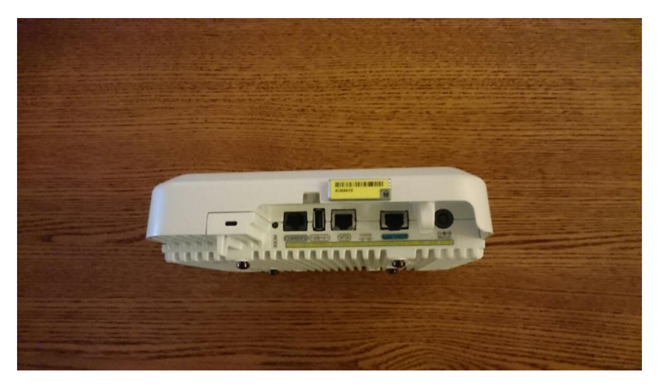
\odot Copyright 2017 Cisco Systems, Inc. 12 This document may be freely reproduced and distributed whole and intact including this Copyright Notice.