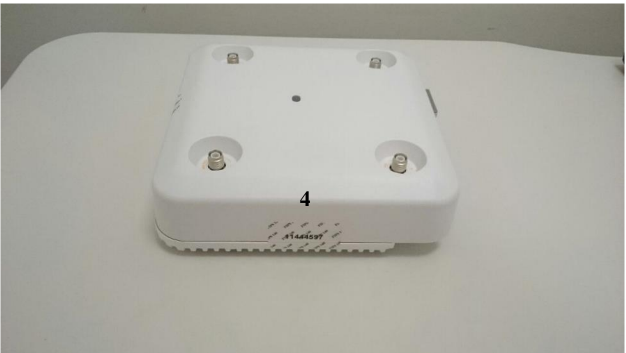
Cisco Aironet 2802e and 3802e tamper label placement (Front, Back, Left, Right)