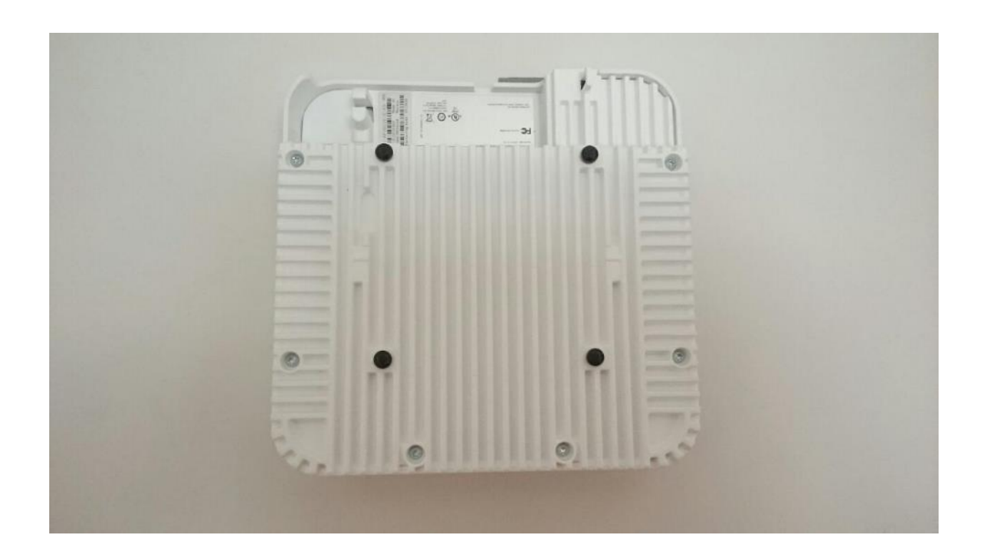
Cisco Aironet 2802e and 3802e (Front, Back, Left, Right, Top, Bottom)