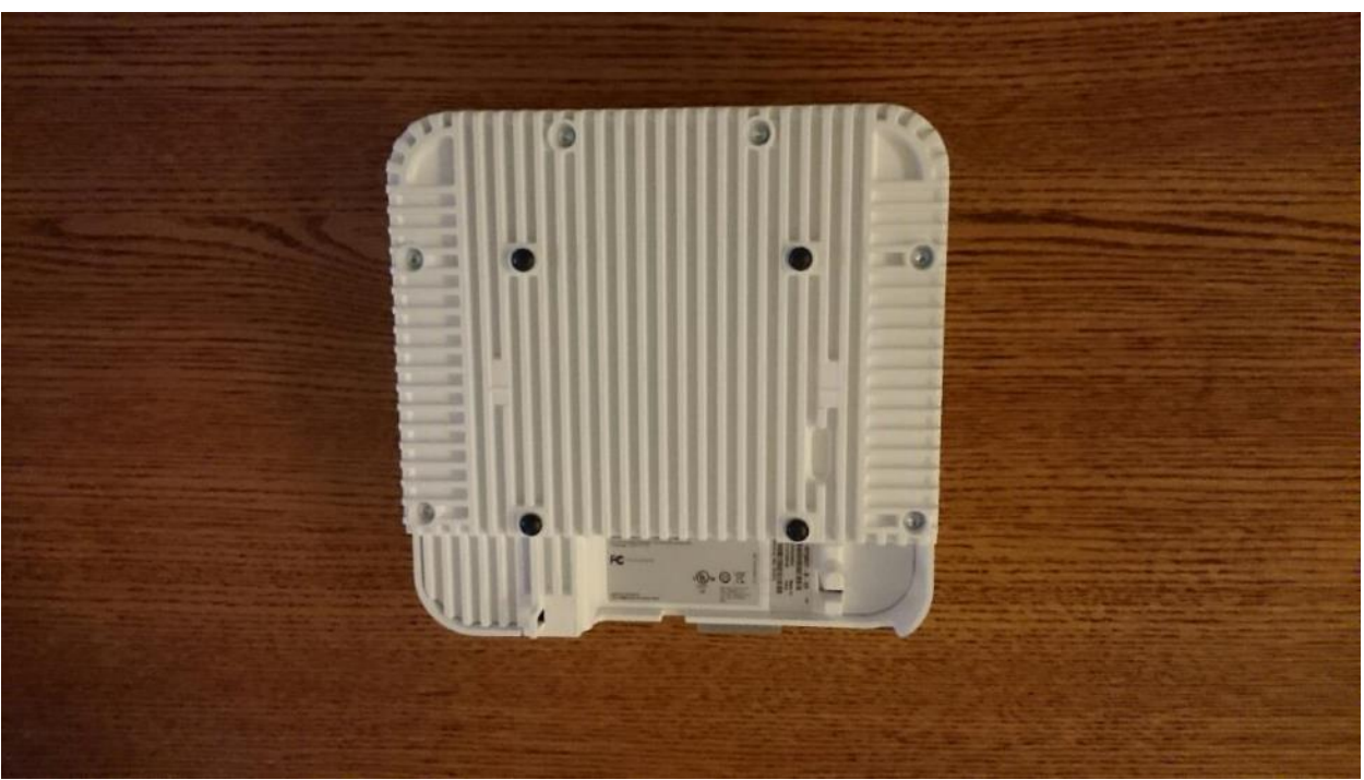
Cisco Aironet 2802i and 3802i (Front, Back, Left, Right, Top, Bottom)