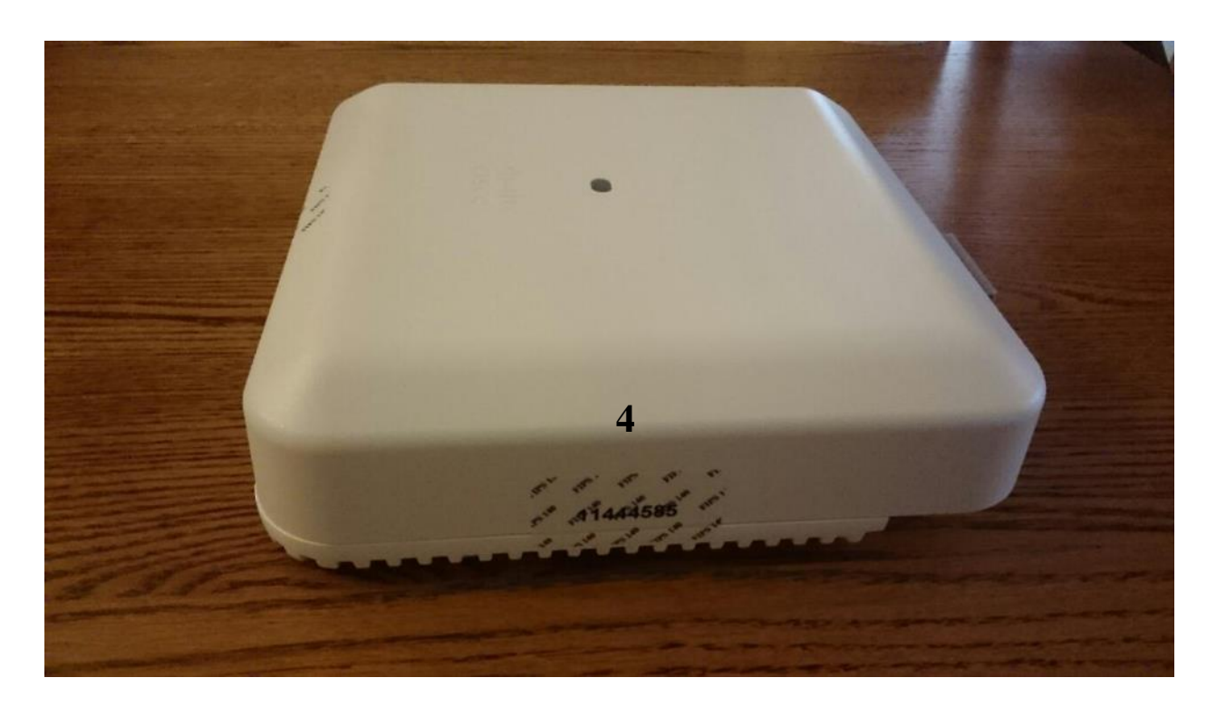
Cisco Aironet 2802i and 3802i tamper label placement (Front, Back, Left, Right)