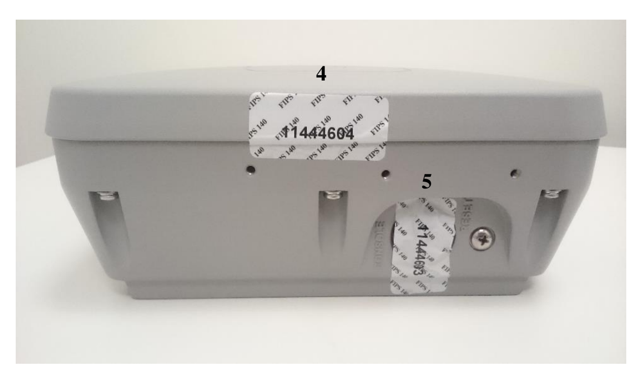
Cisco Aironet 1562i tamper label placement (Front, Back, Left, Right)