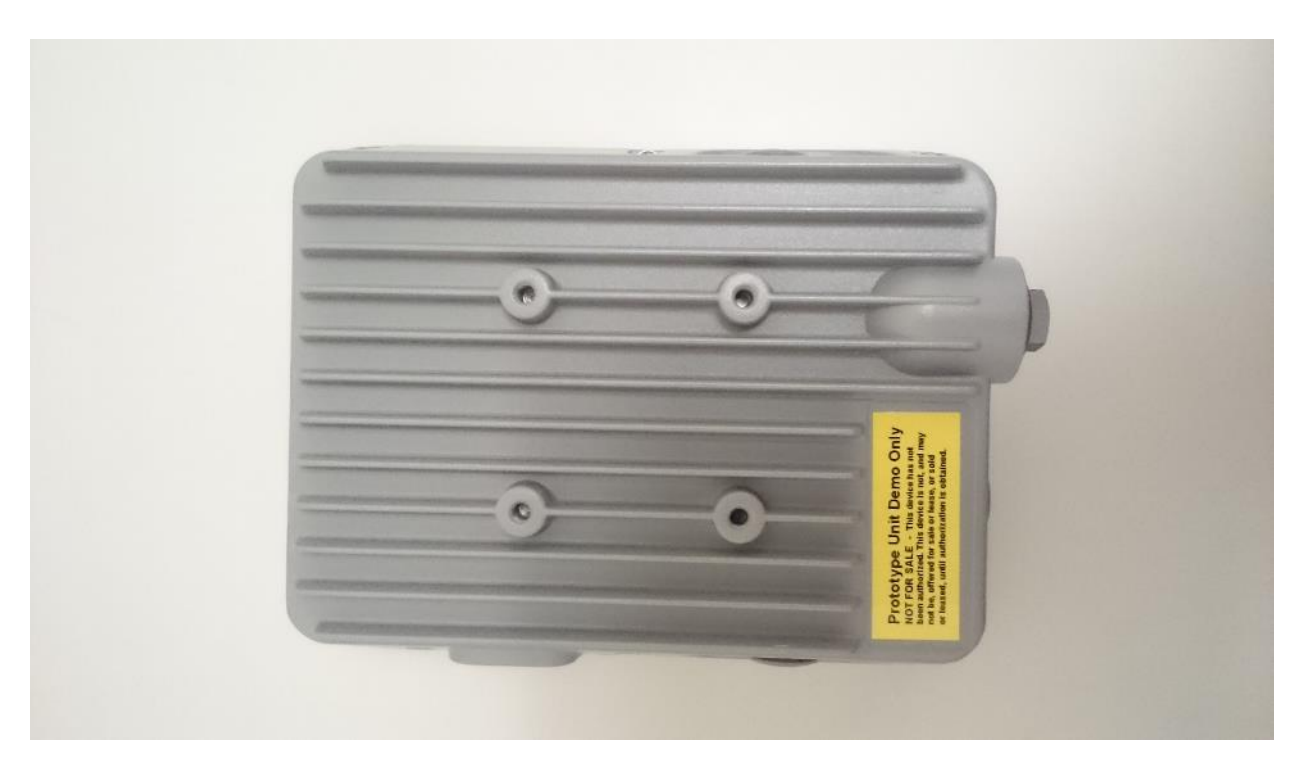
Cisco Aironet 1562i (Front, Back, Left, Right, Top, Bottom)