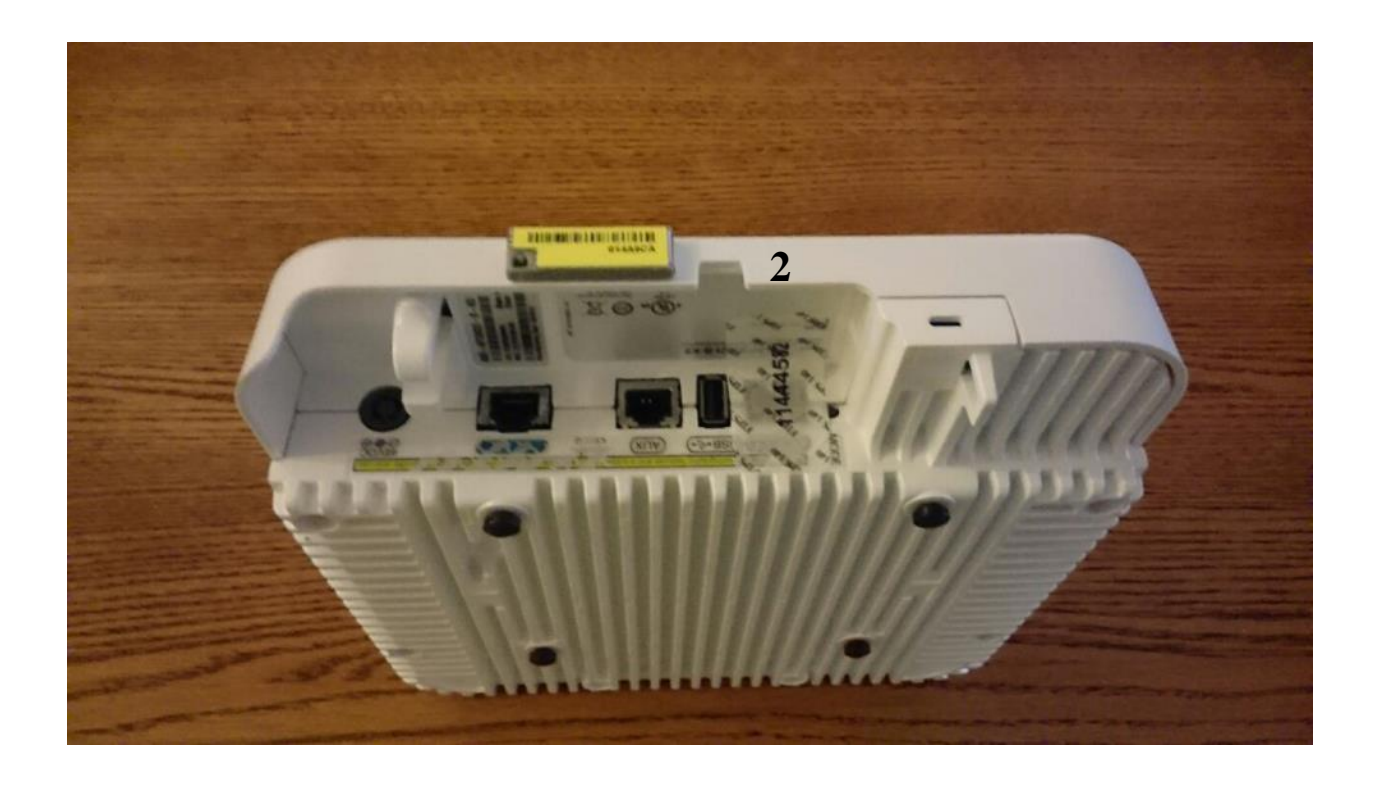
\hbox{@ Copyright 2017 Cisco Systems, Inc.} \\ 26 This document may be freely reproduced and distributed whole and intact including this Copyright Notice.