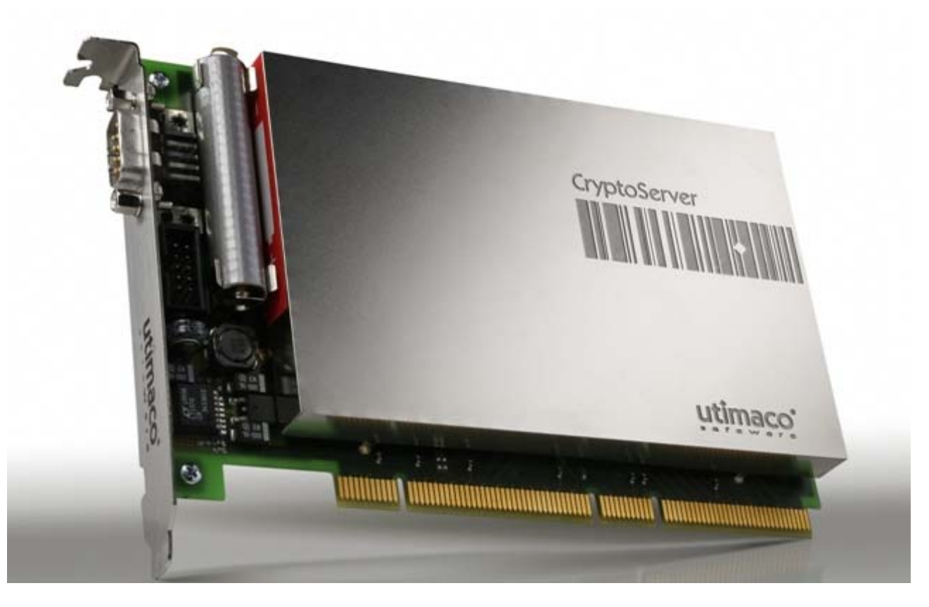
Figure 2 – CryptoServer CS mounted on the PCI carrier card